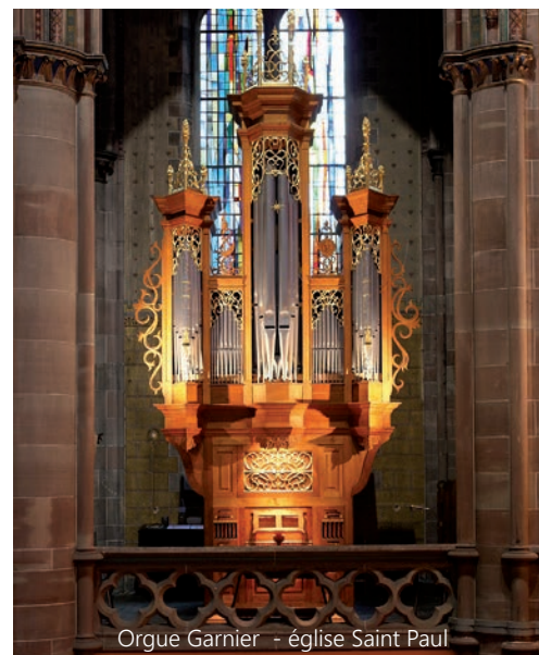
Orgue Garnier - église Saint Paul