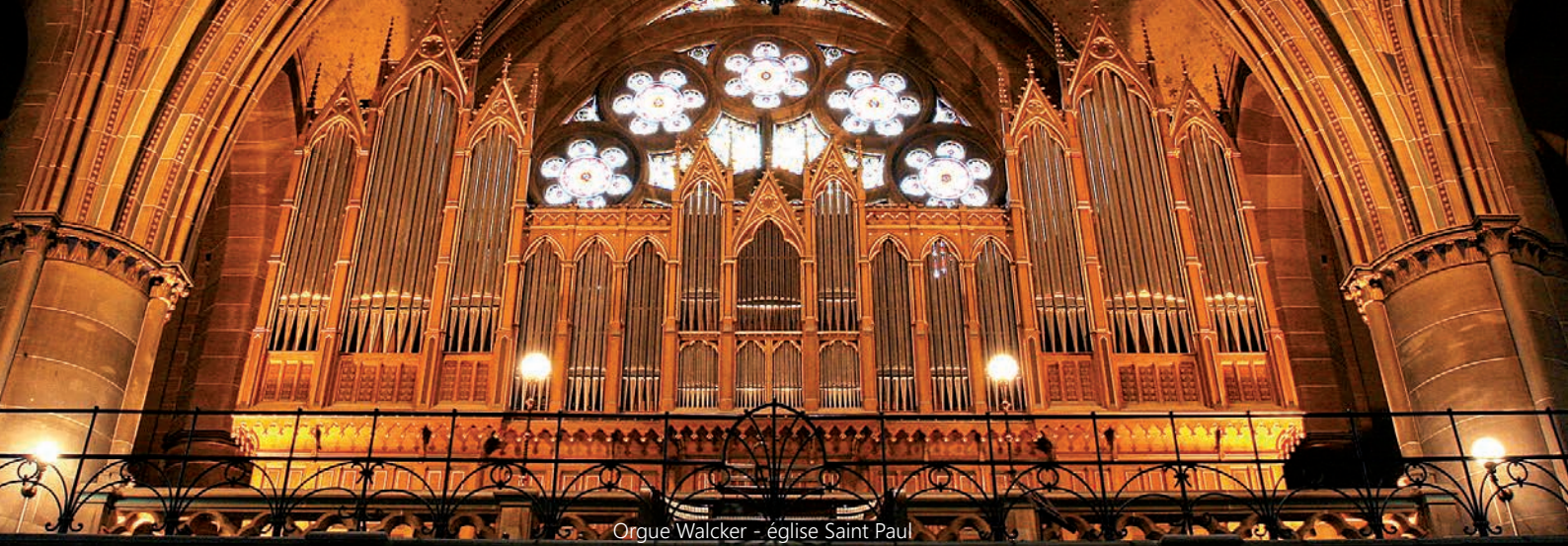
Orgue Walcker - église Saint Paul