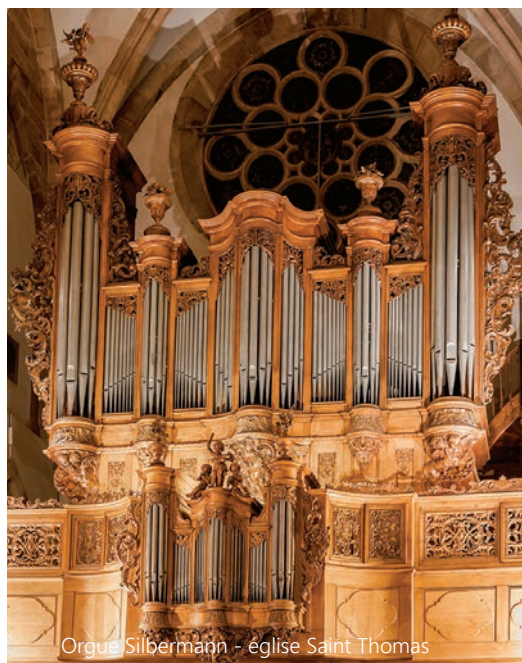
Orgue Silbermann - église Saint Thomas