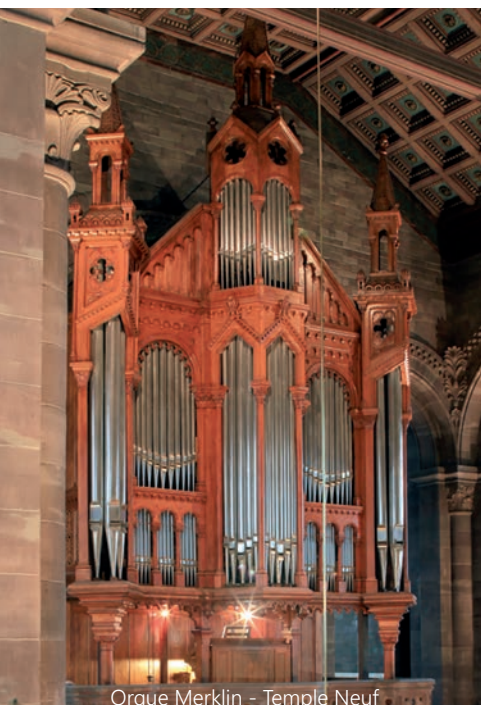
Orgue Merklin - Temple Neuf