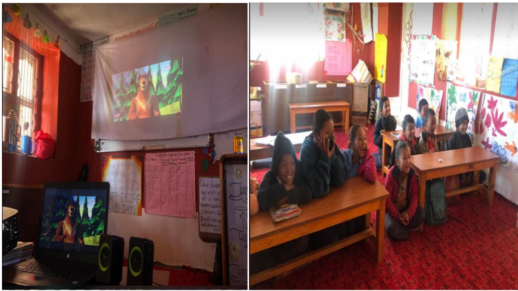
Educational movie time "Super Bear by Wang Qi in English"