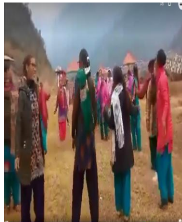
Glimps of parents picnicking at Stone park