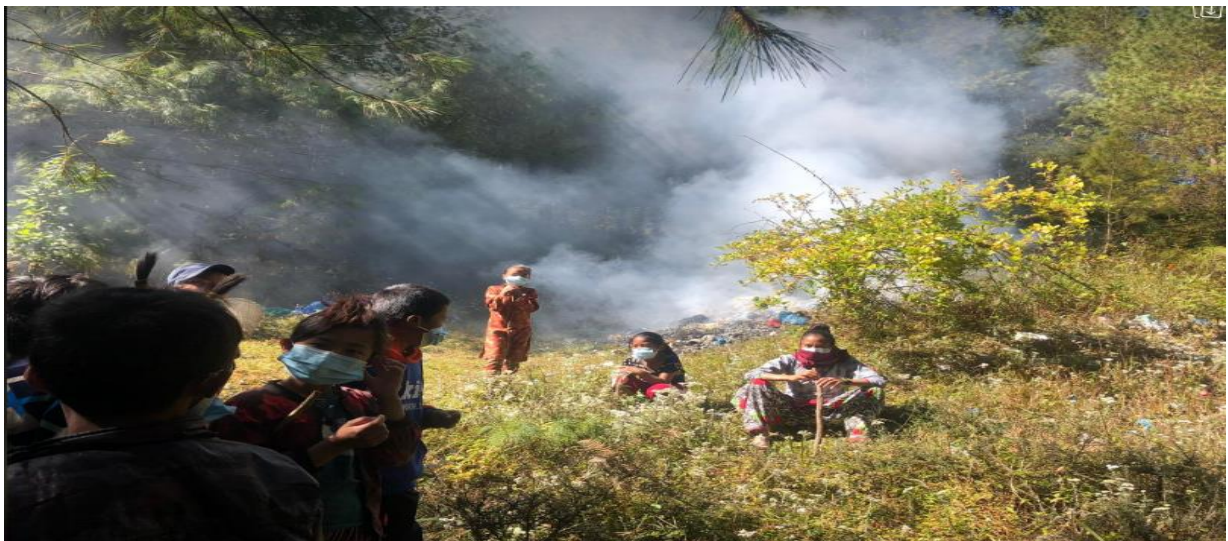
Pictures of students cleaning Hile, Nigale community on Saturdays, Compost pit for non-degradable wastes were burnt to get rid of collected and scattered trashes.