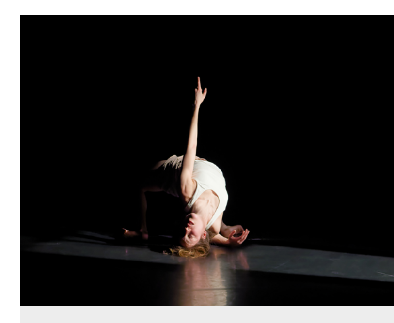
Fora, Cie AR, Alice Rende

During the creation process for FRESH 2023, I faced a critical choice: should I suspend the entire structure, or leave it fixed to the floor? This decision would significantly affect both the movements I could perform inside and the audience's interpretation. I chose to share my creative process from an intimate perspective rather than presenting a polished segment of the show. To illustrate this, I installed one box on the floor