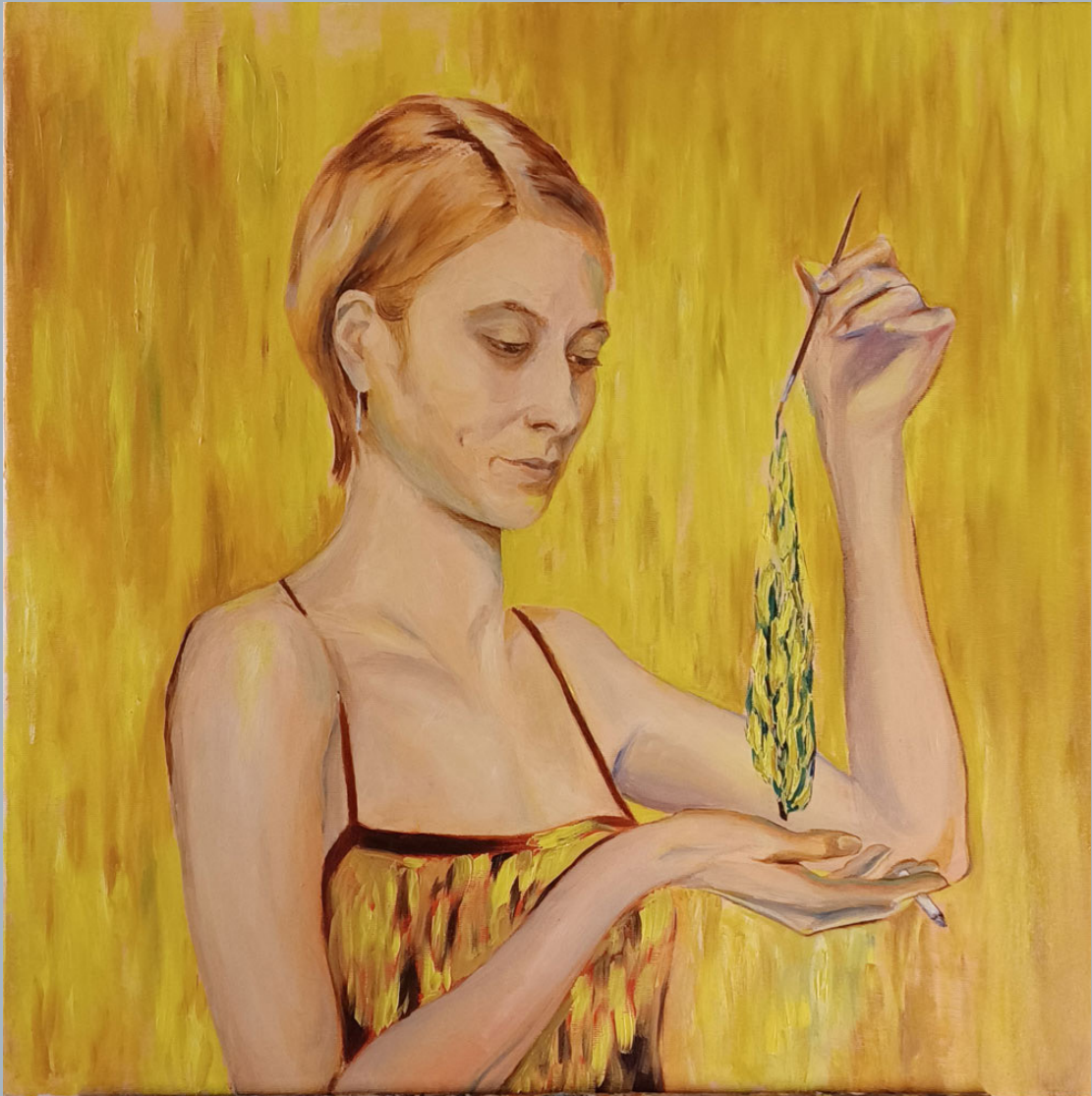
Mädchen mit Zypresse self-portrait oil on canvas | 60x60cm | 2021