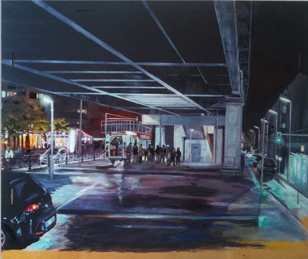
Kältebus Kottbusser Tor oil, acryl on wood | 50x60cm | 2021