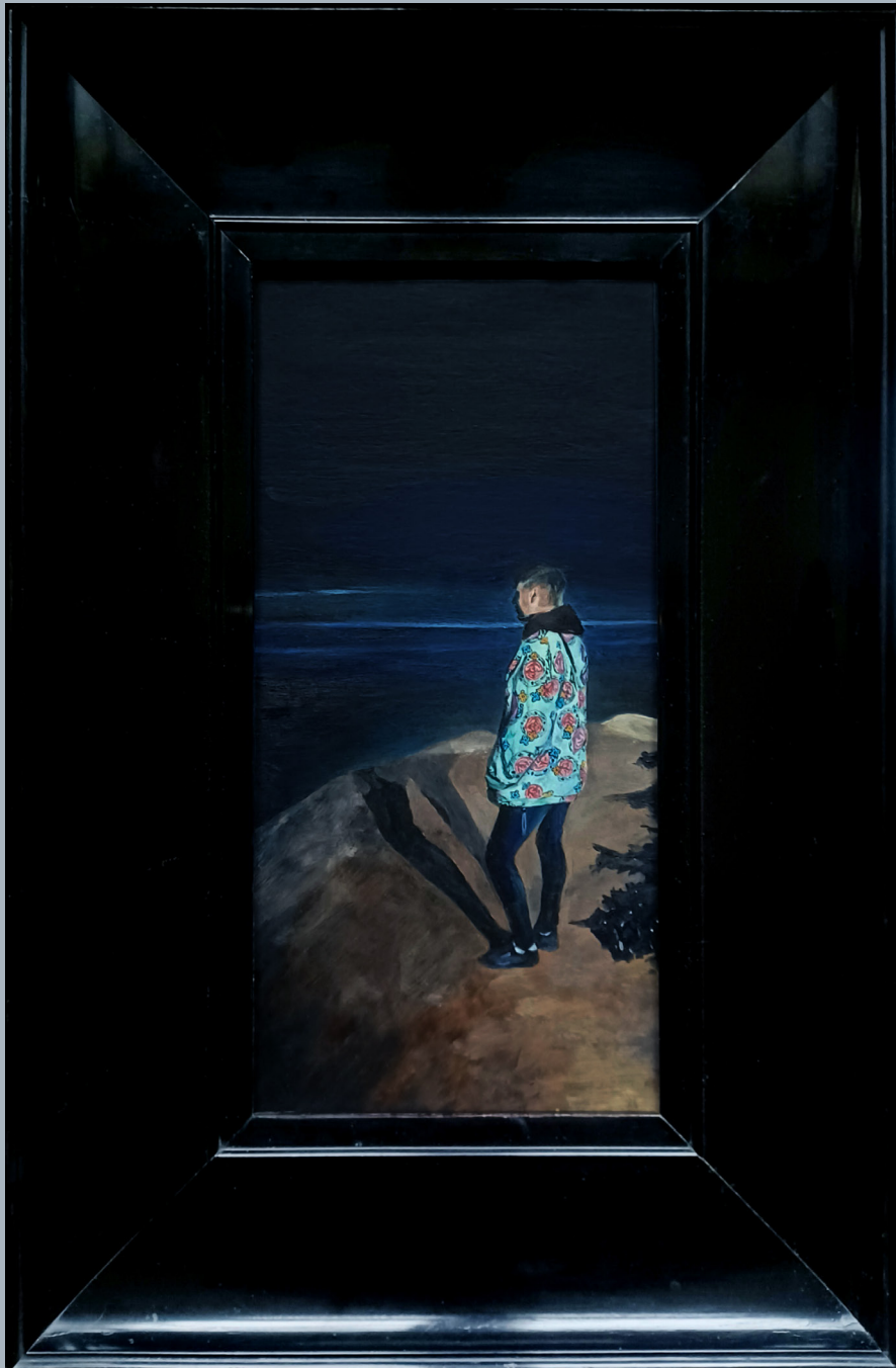
Wanderer am Gestade des Meeres oil on wood | 25,5x38,5cm (w. frame) | 2022