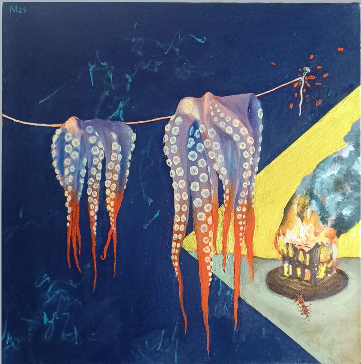
The Sacrifice oil, acryl on canvas | 30x30cm | 2024