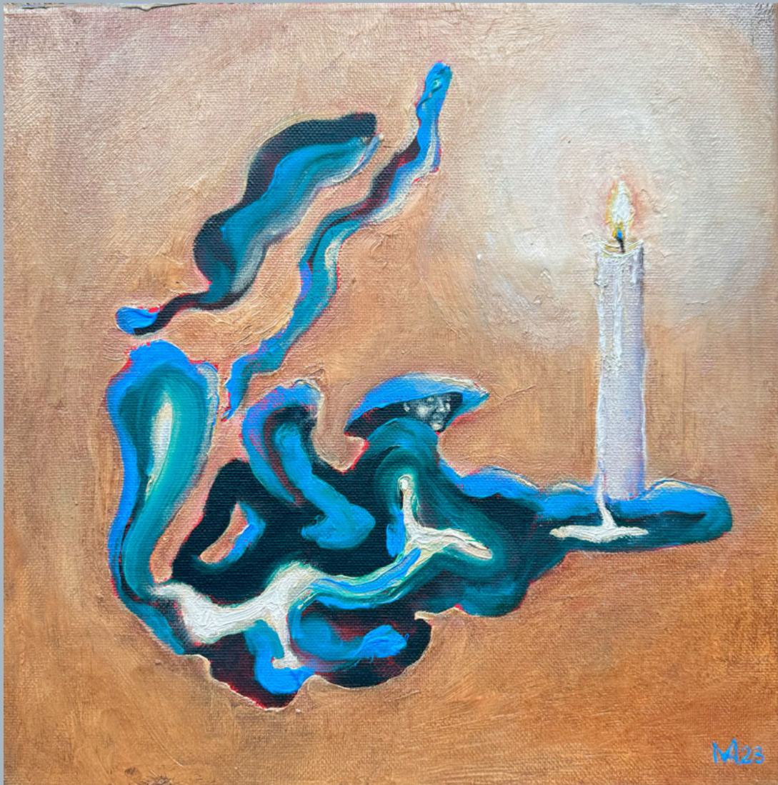
Gedanken aus Wax oil, acryl on canvas | 30×30cm | 2023