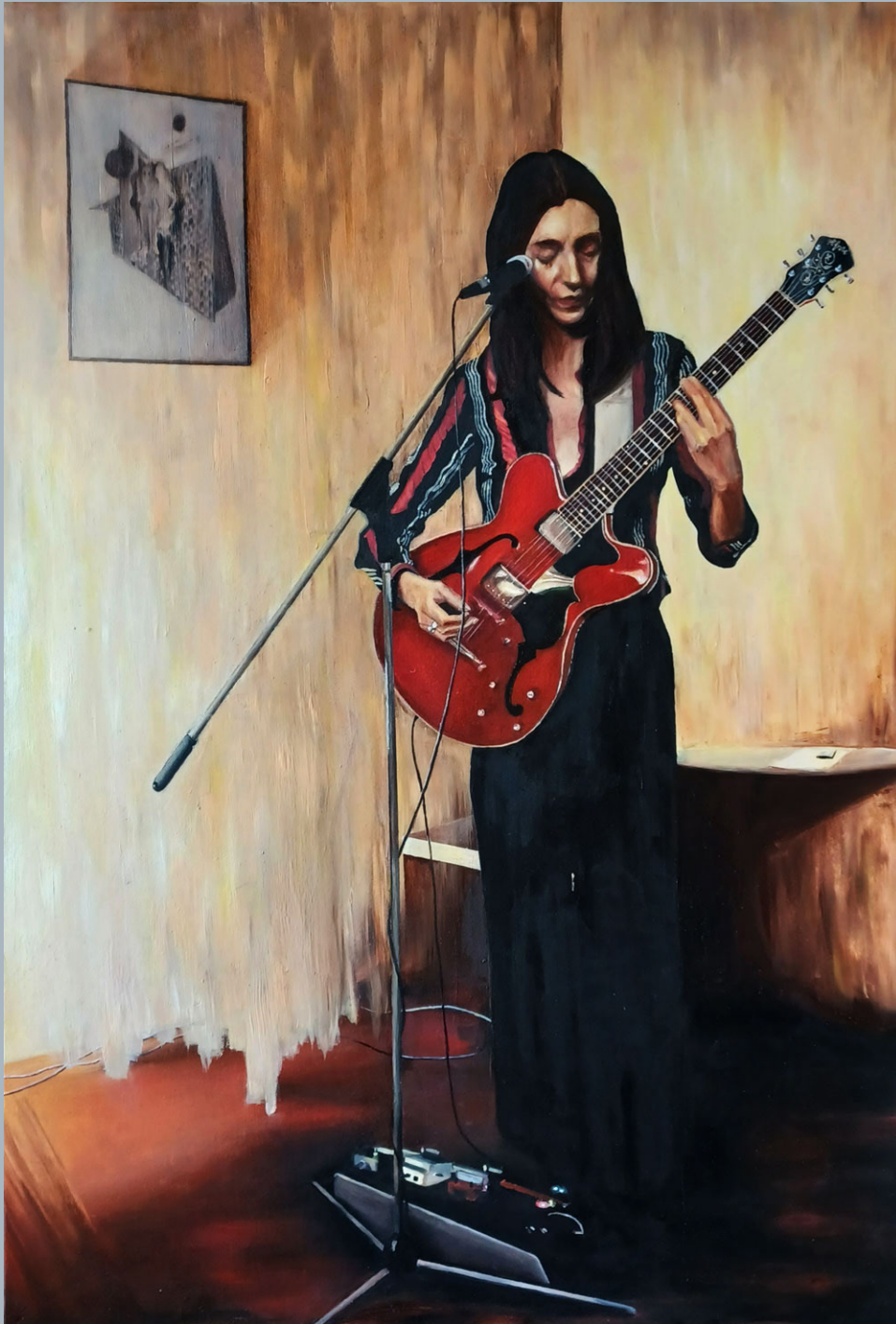
Easy as a Gun Mika Bajinski oil on canvas | 100x70cm | 2022