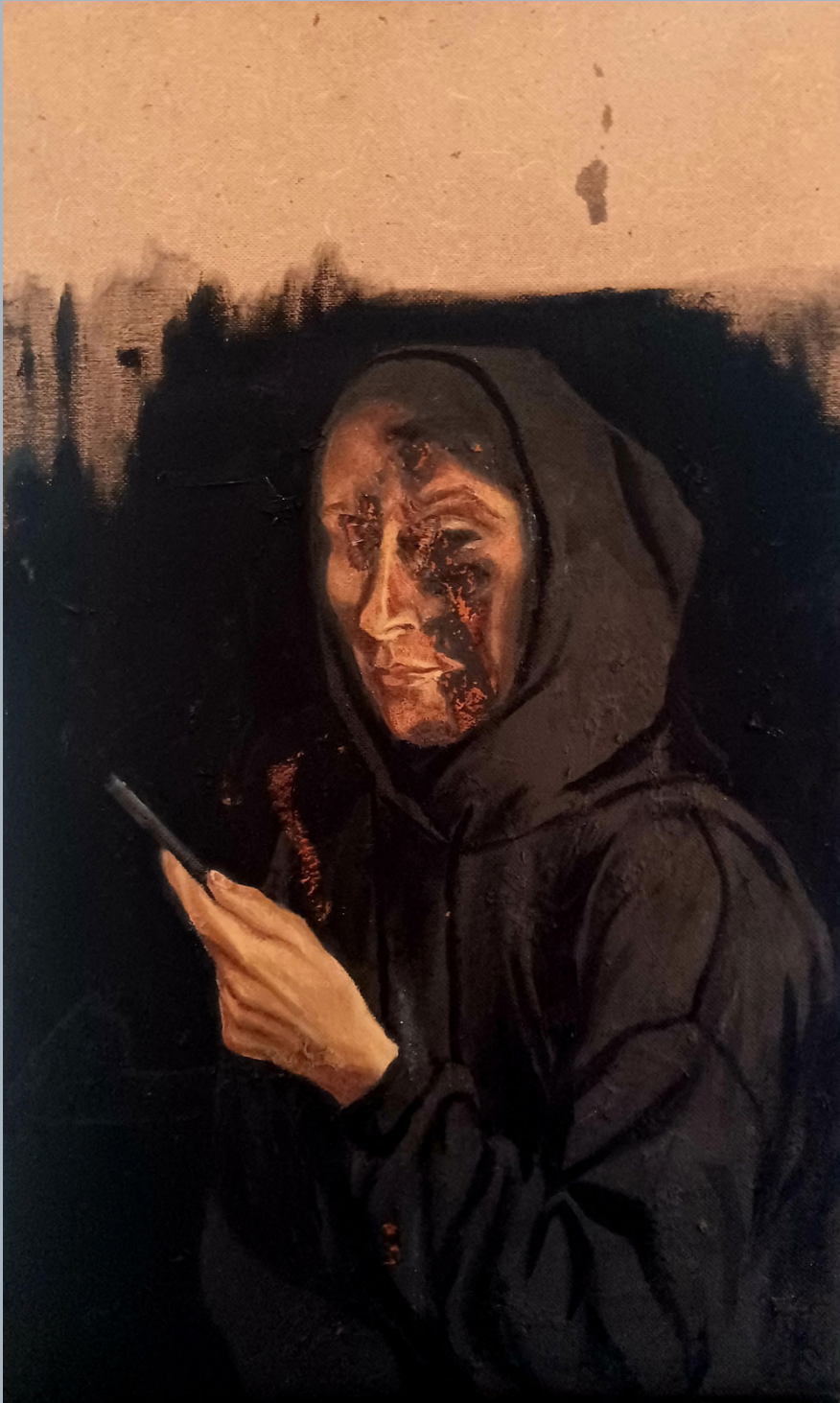
self-portrait oil, acryl on wood | 72,5x45cm | 2021