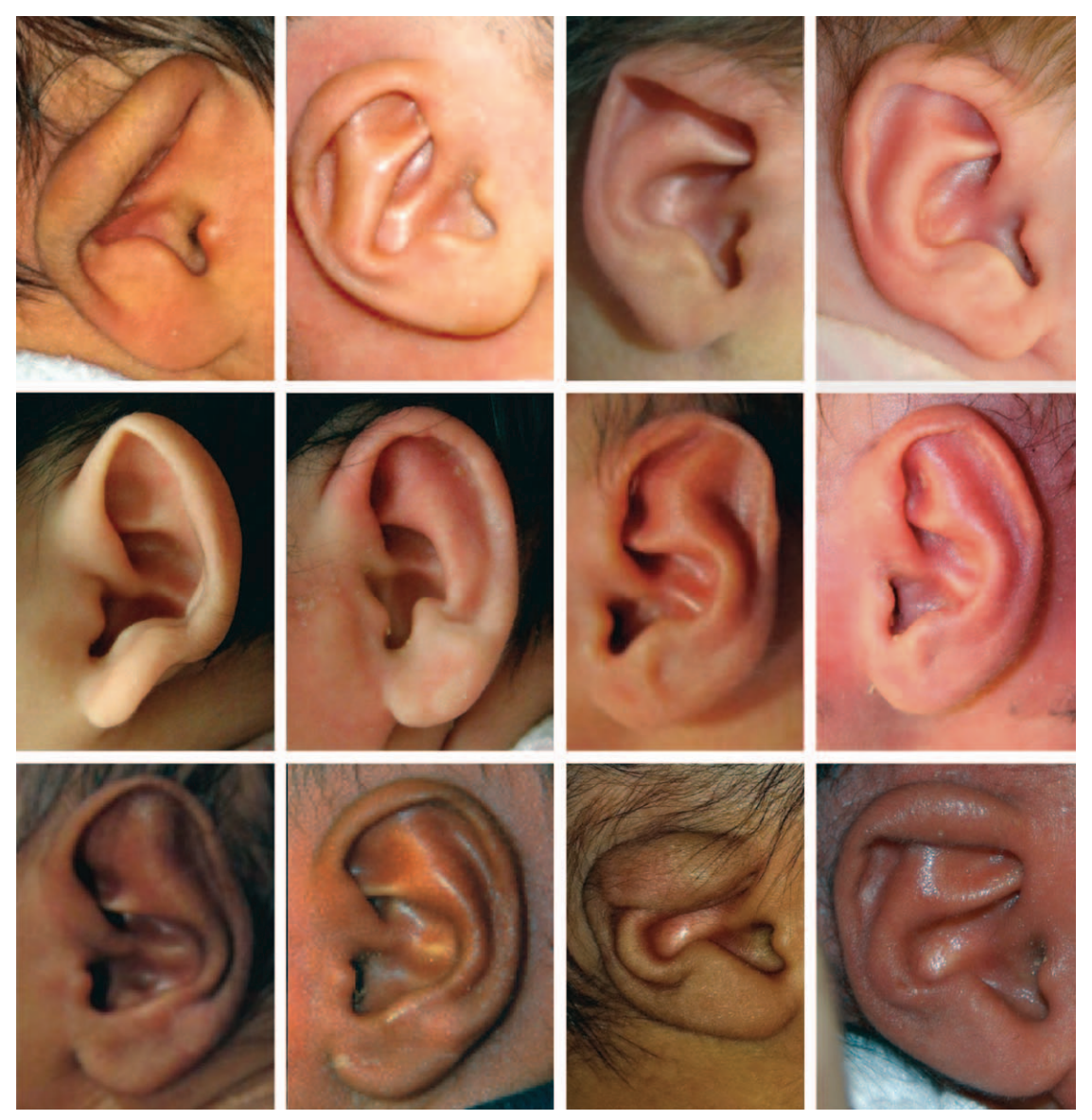
Fig. 3. Ninety-six percent of the parents rated the outcome from molding as excellent or greatly improved. Presented are examples of pretreatment ( left in each pair ) and posttreatment ( right in each pair ) photographs of a child with a constricted ear deformity ( above , left ), a helical deformity ( above , right ), a constricted ear deformity ( center , left ), a Stahl deformity ( below , left ), and a helical rim deformity ( below , right ). Photographs were taken after 2 weeks of treatment. Correction was maintained for 2 years.

off and the ear being held in a stronger, more consistent mold. 3,5-8,10,13,14 Underscored by scientific data, which documented that the ear cartilage is most pliable when circulating estrogens are elevated in the neonatal period, studies have demonstrated ear molding results are best if molding is started before 6 weeks of life. 3,5,8 Fueled by these data, the current study aimed to capture babies at the peak of maternal estrogen levels and use a more rigid molding device to reduce treatment time and obtain a higher level of success than previously reported.