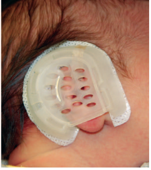
Fig. 1. The EarWell Corrective Infant System is composed of an anterior (cap) and posterior cradle, retractor, and a conchal former ( left ). A newborn baby with the EarWell in place ( right ).