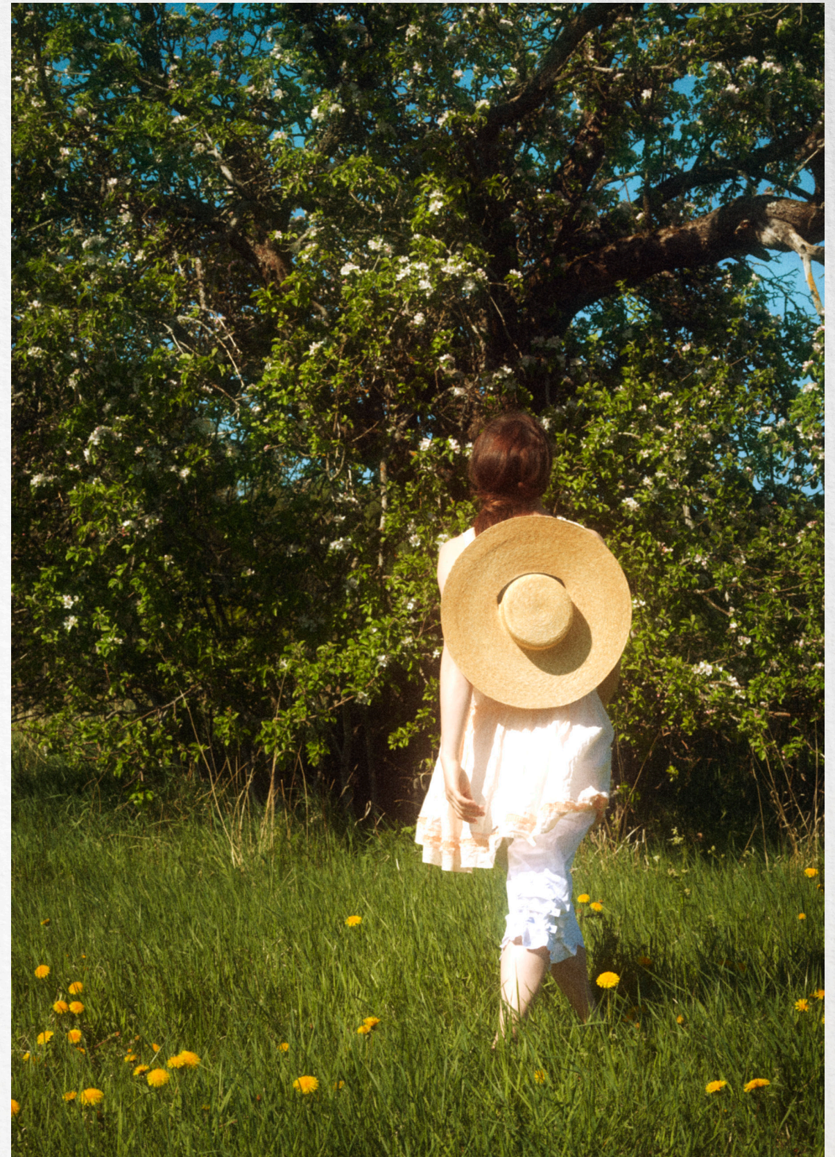
Tunic Hetty 33351, Trousers Asta 11387