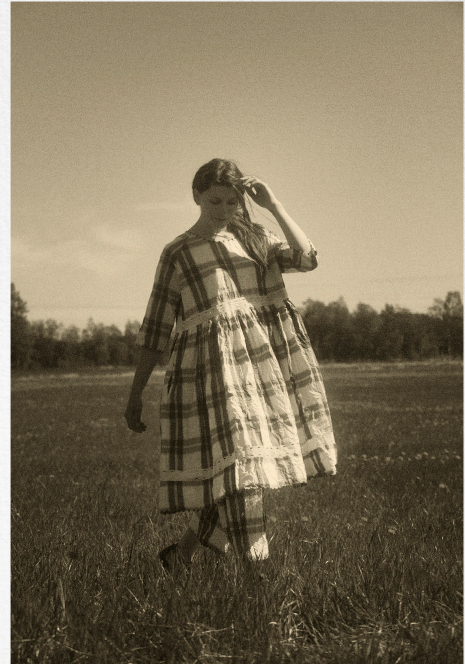
Dress Alma 55786, Trouser Henny 11385