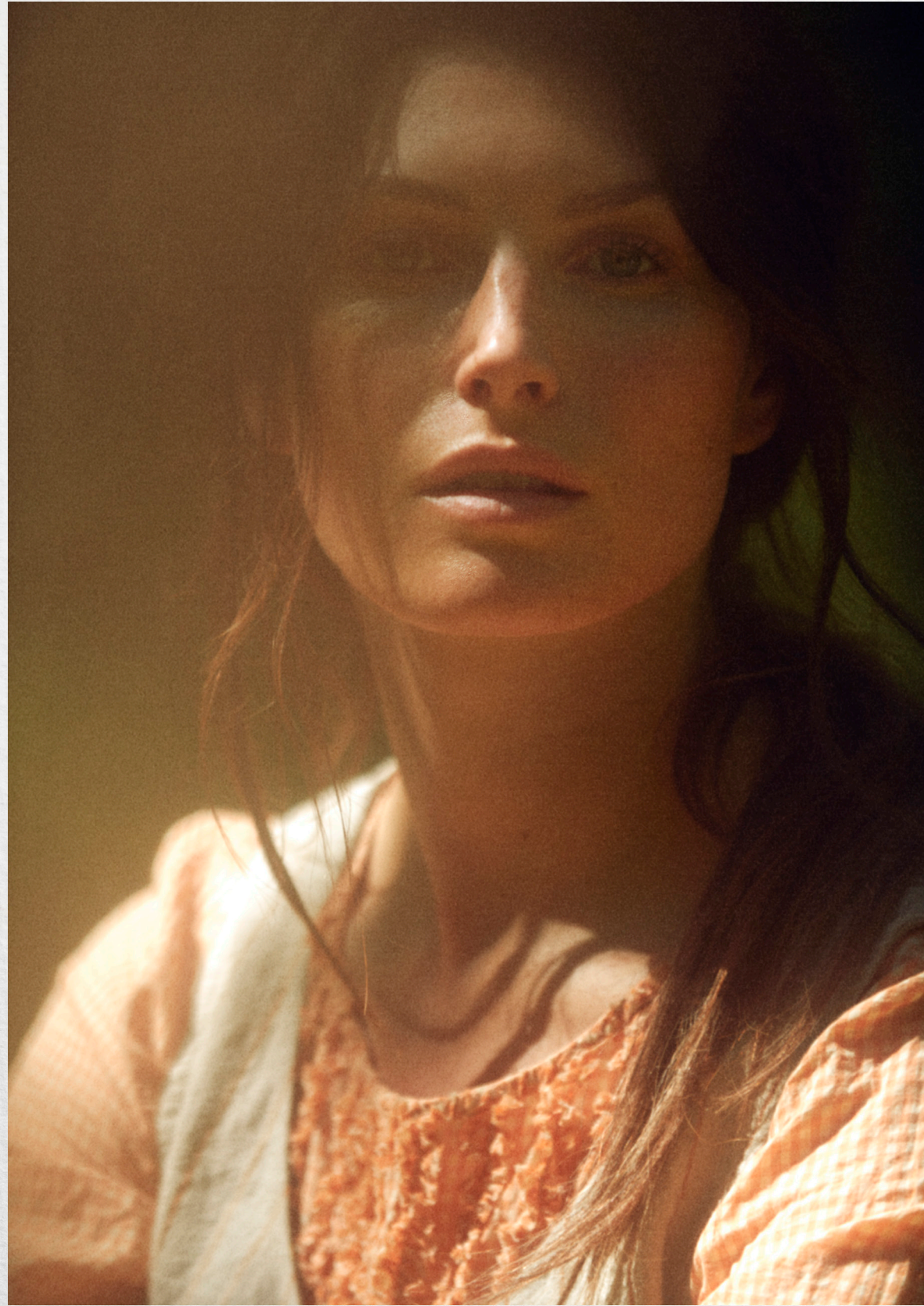
Dress Erntvid 55783, Vest Aberta 33343