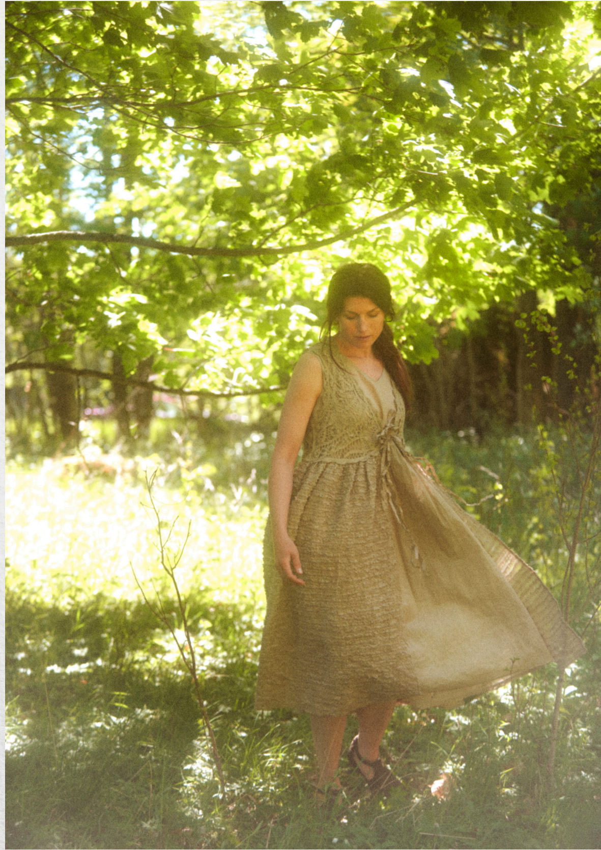
Dress Gustava 55801