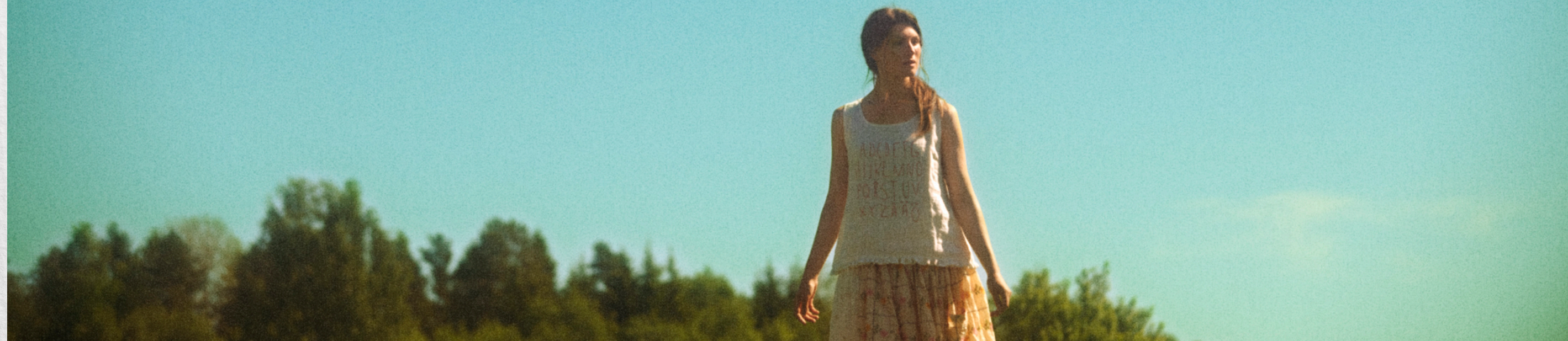
Cover Dress EKanta 55800, Skirt Time 22191