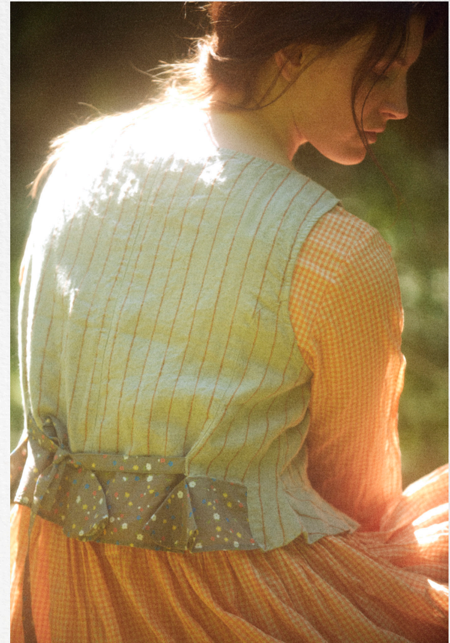
Vest Alberta 33343, Dress Erntid 55783