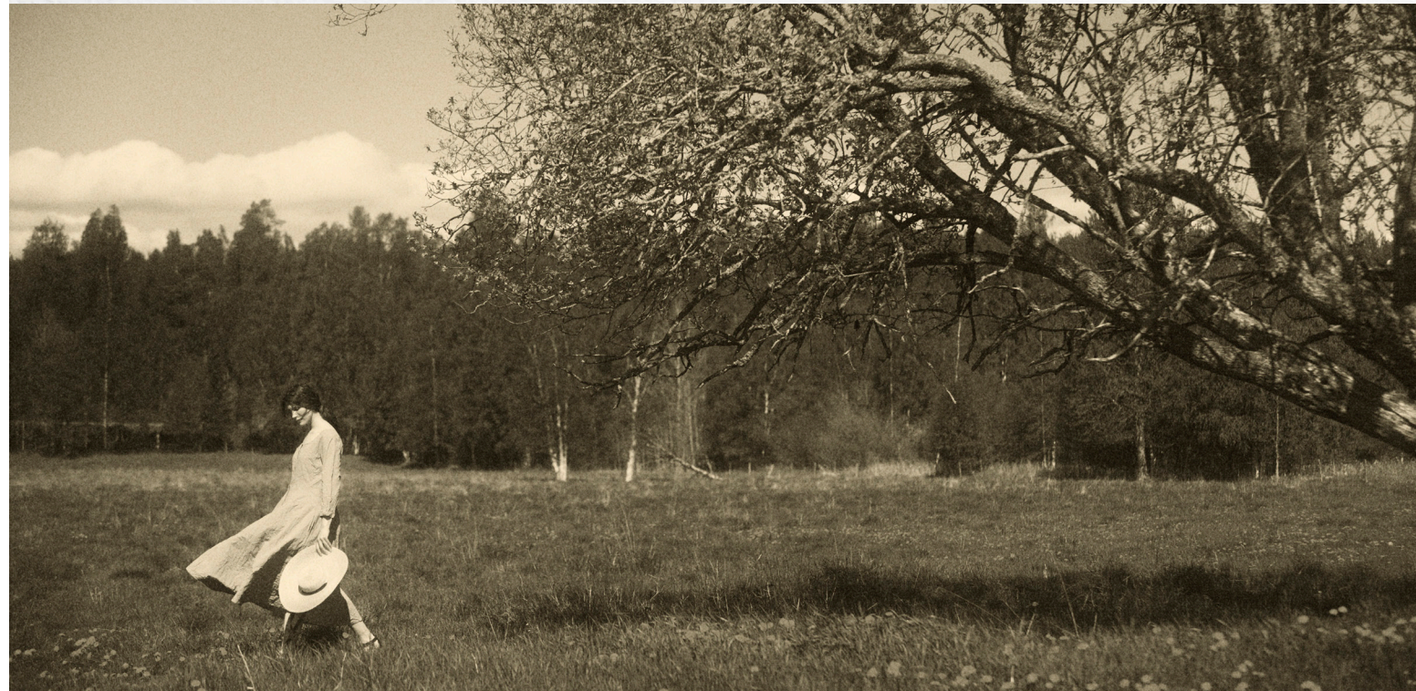
Dress Adina 55794