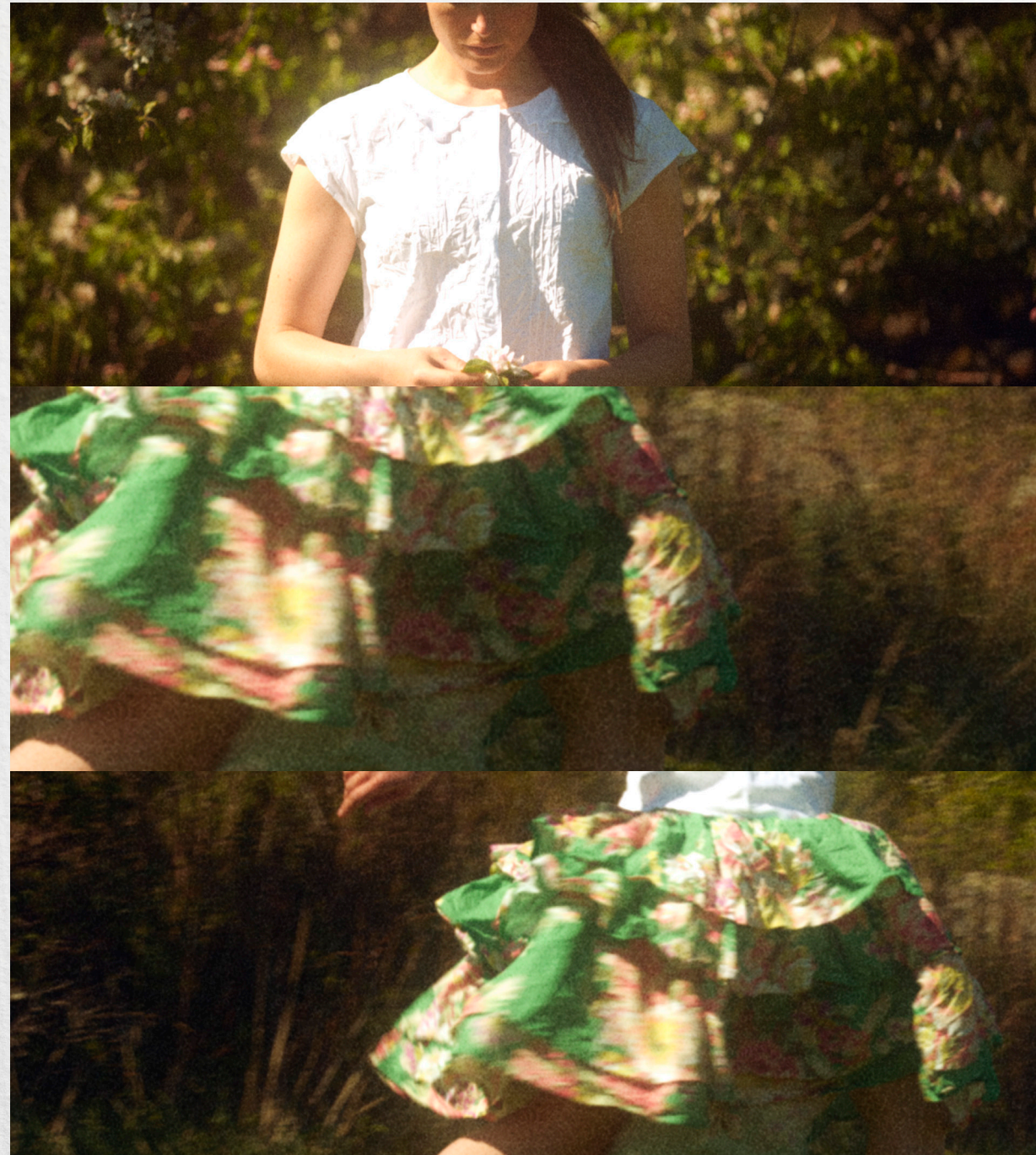
Blouse Lou 44903, Skirt owena 22181