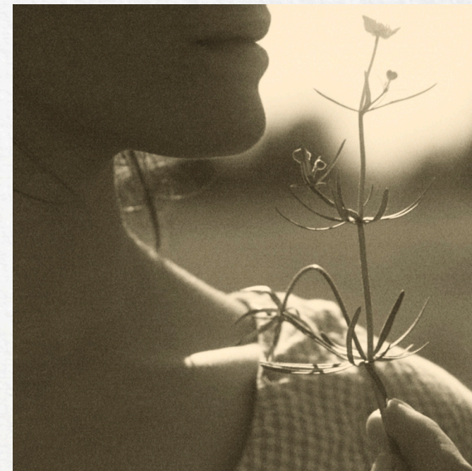
Top Elinda 33345, Skirt Bernic 22175, Apron Gunny 77560