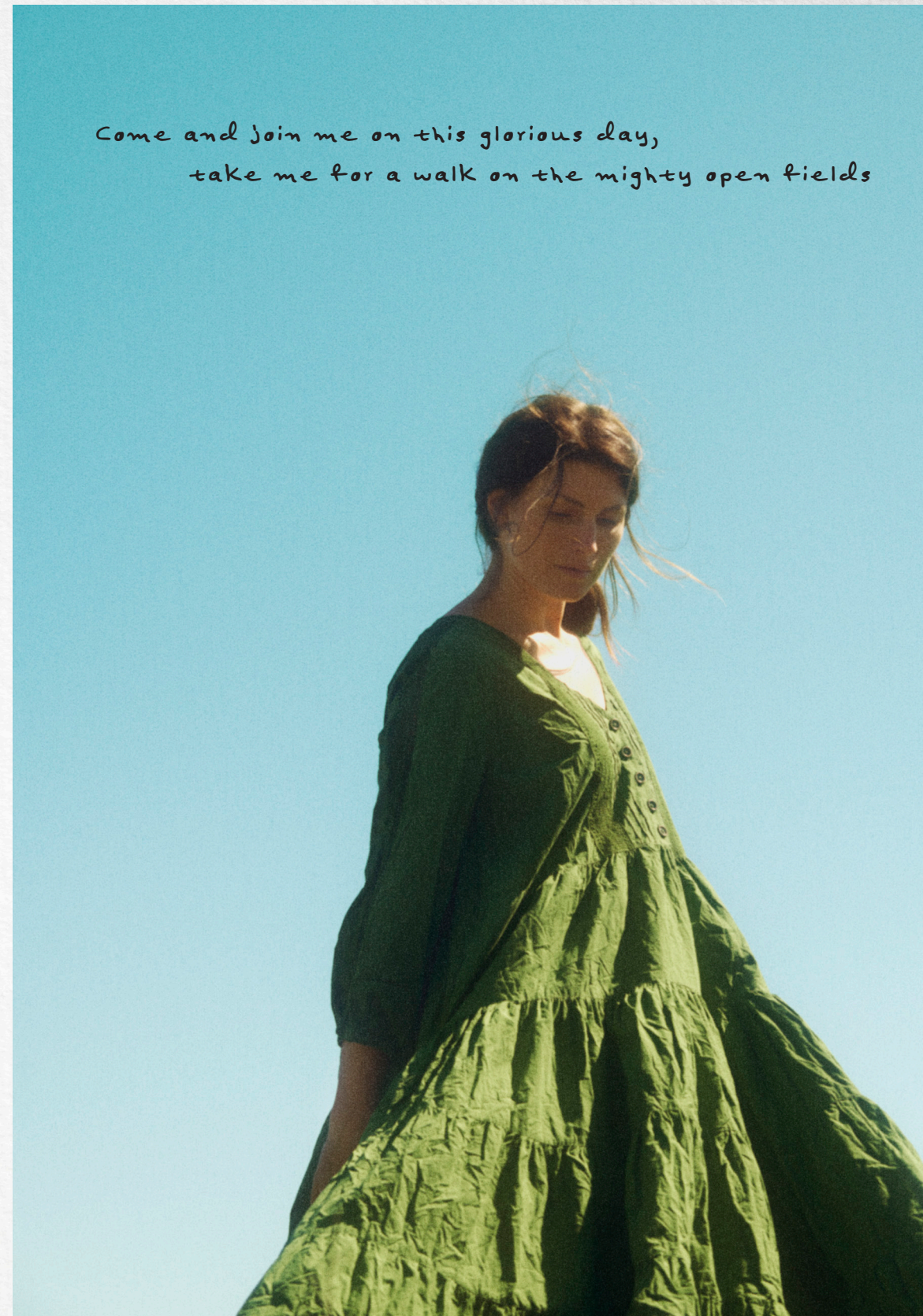
Dress Dean 55788, SKirt Evelyn 22180

Come and join me on this glorious day, take me for a walk on the mighty open fields