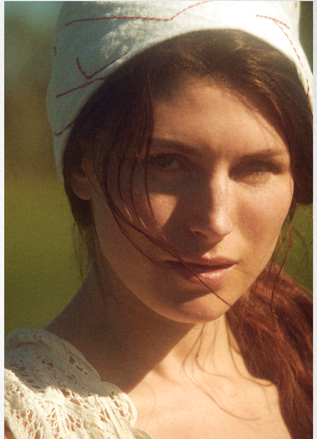
Dress Chessy 55789, Vest Geraldine 33348 Skirt Bernie 22175, Kerchief Gullan 77554