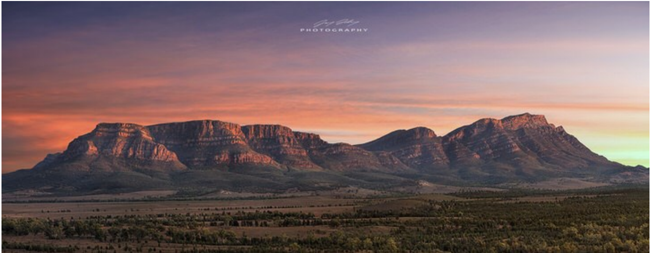
Wilpena Pound, South Australia