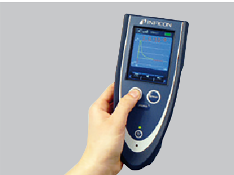
Remote control Compatibility to INFICON RC1000 for wireless operation.