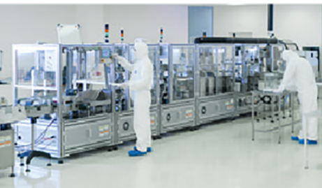
Diaphragm pump For oil-free systems and processes.