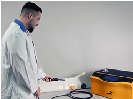
Different leak testing methods Suitable for every application.