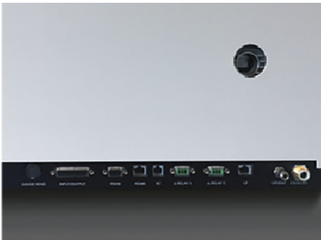
Interfaces LX218 has a wide variety of interfaces and connections to expand its capabilities.