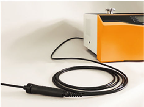
Sniffer line 3, 5, 10 m For the sniffing leak testing method.