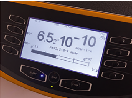
Easy-to-use display It's easy to operate and features a large graphic display for quick assessment.