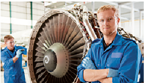
Oil-sealed rotary vane pump For General Industrial application, where robustness is required.