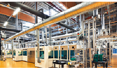
Module Without forepump, for easy and affordable system integration.