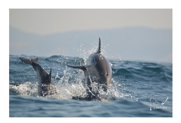
Day 2 – Day 6:

On arrival to Durban, you will be met by our local operator and transferred down to our Lodge which is an approx. 5 - 6 hour drive. It is best to arrive before midday as we do not like to drive on the roads in the dark. You will settle in and prepare your gear for the next day's action. After dinner you will discuss the next day's plan with your skipper and our aircraft Pilot usually they will have a good idea of where and what the action has been and will make a few recommendations to choose from.