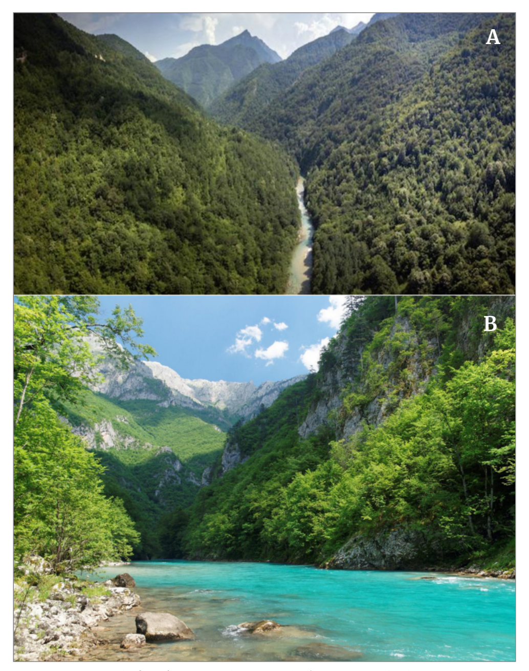
Figure 2. Nature before 'green and sustainable' renewable hydroelectric plants. Examples of the unique, biodiverse and healthy river networks in the Balkans: (A) the Upper Neretva in Bosnia-Herzegovian, a pristine valley with intact forest and living rivers, threatened by seven hydropower projects; (B) the Tara in Montenegro, one of the most valuable rivers on the Balkans, threatened by a large dam downstream on the Drina river.

messages might not belong to the "narratives of hope" that help to promote action (Folke et al. , 2021: 848). However, illusions and wishful thinking mislead or lead nowhere and, as Burger and co-workers (2012:6) remark, "the role of science is to understand how the world works, not to tell us what we want to hear".