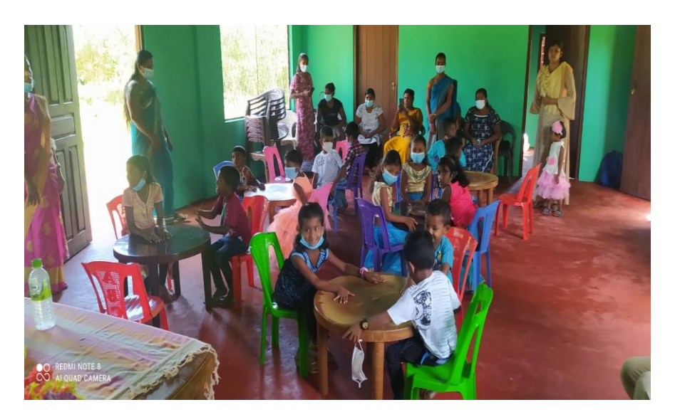
The head table of the officials & the RDS secretary addressing the community

The preschool children are seated in the newly given classroom chairs