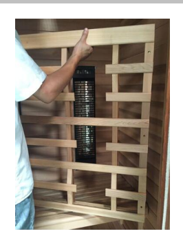
<11> INSTALL THE TWO FRONT HEATERS.