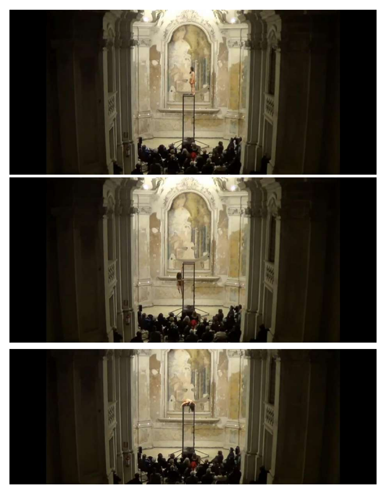
CHURCH of Castel Bolognese (Italy) November 2021