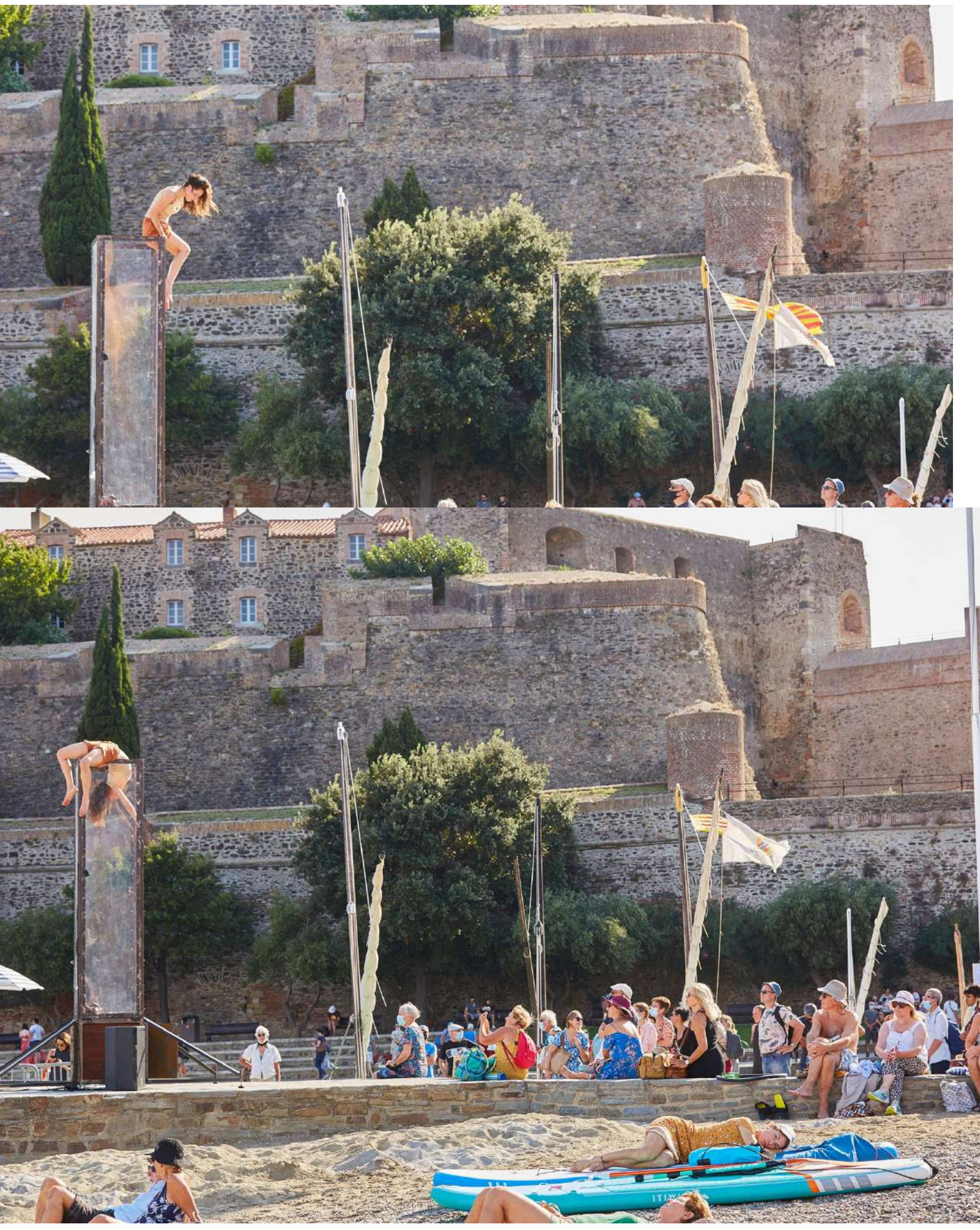
THE PORT OF COLLIOUREPhotos by Emmanuel Layani, September 2021