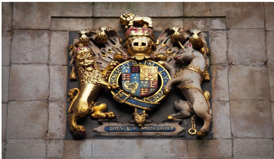
Coat of arms of Charles II on St John's Gateway Bristol England

Revealing techniques of societal control to the public, explicitly through the media, with signs and symbols to those in the know , so to speak, far from endangering these hidden machinations, provides the best protection to hidden interests and identities. This explicit promotion of the elite of what they are doing, i.e., public relations, should not be confused with education and conscious understanding of such methods. Exposure of the symbolic aspects of historical events can have the effect of simply extending the unconscious reach of occult symbolism itself. How can this be the case?