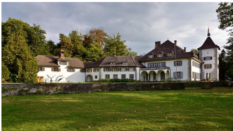
Chateau Au, Zürich, Switzerland

Around 1957 after attending Spohn Gymnasium in Germany, Schwab went back to Switzerland. From 1958 to 1966, he worked for Escher-Wyss in Zurich, and was the assistant to the CEO “VDMA” (Association of mechanical and plant engineering) in Frankfurt. After this, he went to America for his Masters and met Henry Kissinger and Kenneth Galbraith. Back home, he received his Doctorate, form the University of Bern, and at the age of 30, he became member of the board of Escher-Wyss in Zurich, responsible for integrating Escher-Wyss into Sulzer AG. Notably, in Au, near Zurich (Switzerland) Klaus Schwab spent two years in primary school (1945 – 1947), site of Chateau Au, to which Klaus is inextricably linked. iv He was also a professor at Centre d’Etudes Industrielles in Geneva. After 2 years, he started the World Economic Forum on 24th January 1971.