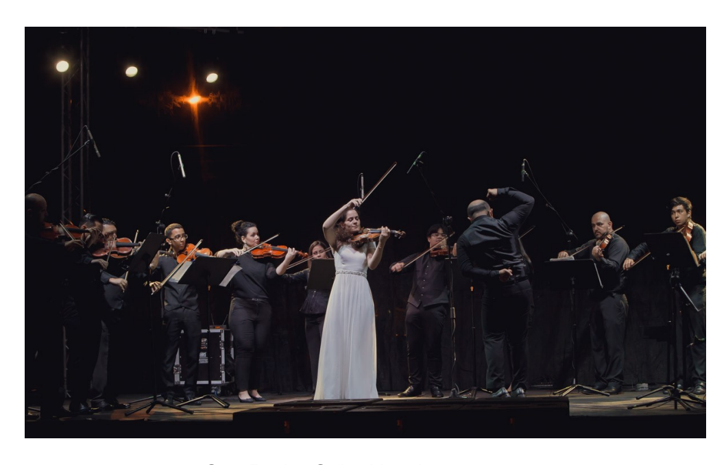
San Pedro Sula, Honduras, 2018

For the next season, the orchestra has more than ten confirmed concerts, which will be offered to the main cities of Honduras, presenting high-level programs with famous soloists and conductors, who have expressed their desire to collaborate and support the artistic enhancement of our city.