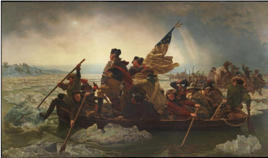
Emanuel Leutze, Washington Crossing the Delaware , 1850 viii