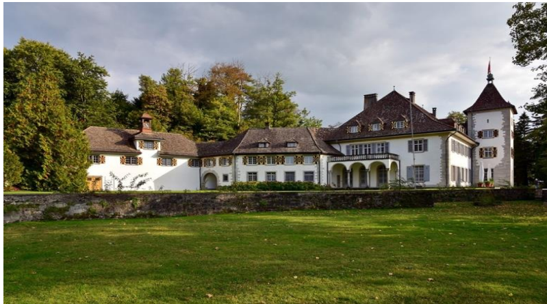
Chateau Au, Zürich, Switzerland

Around 1957 after attending Spohn Gymnasium in Germany, Schwab went back to Switzerland. From 1958 to 1966, he worked for Escher-Wyss in Zurich, and was the assistant to the CEO "VDMA" (Association of mechanical and plant engineering) in Frankfurt. After this, he went to America for his Masters and met Henry Kissinger and Kenneth Galbraith. Back home, he received his Doctorate, form the University of Bern, and at the age of 30, he became member of the board of Escher-Wyss in Zurich, responsible for integrating Escher-Wyss into Sulzer AG. Notably, in Au, near Zurich (Switzerland) Klaus Schwab spent two years in primary school (1945 – 1947), site of Chateau Au, to which Klaus is inextricably linked. iv He was also a professor at Centre d'Etudes Industrielles in Geneva. After 2 years, he started the World Economic Forum on 24th January 1971.