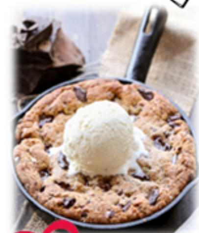
The Cookie Crush $10

Chocolate cake with Molten Gooey Chocolate Center Served with Vanilla Ice Cream