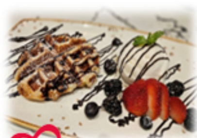
The Krispy Treat $12

Freshly Warm Buttery, Flaky Croissant Krispy Waffle Served with Vanilla Ice Cream, Berries and Chocolate Drizzle