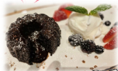
The Chocolate Devotion $12

Freshly Warm Buttery, Flaky Croissant Krispy Waffle Served with Vanilla Ice Cream, Berries and Chocolate Drizzle