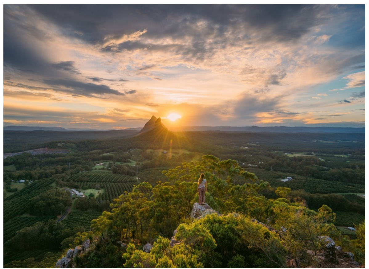
Glass House Mountains