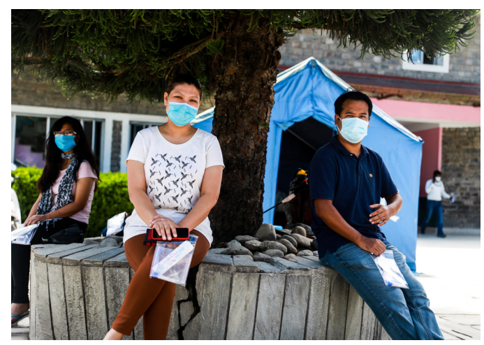
Close contact staff of COVID cases queuing up for RT-PCR tests.