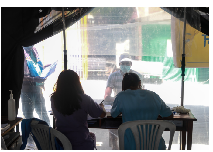
Triaging of the patient in Triage 2.