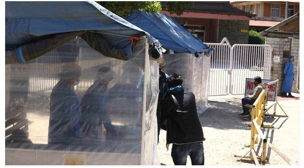
Triage set up at the gate.

Triage tents were set up at the gate and outside the Emergency Department and all individuals entering the hospital were screened for fever and provided with hand sanitizer. Only patients and relevant people were allowed in the hospital. The contact addresses of all individuals who returned from abroad were noted and were further advised to adhere to strict home quarantine rules. More than 1,00,000 individuals have been triaged at the gate so far.