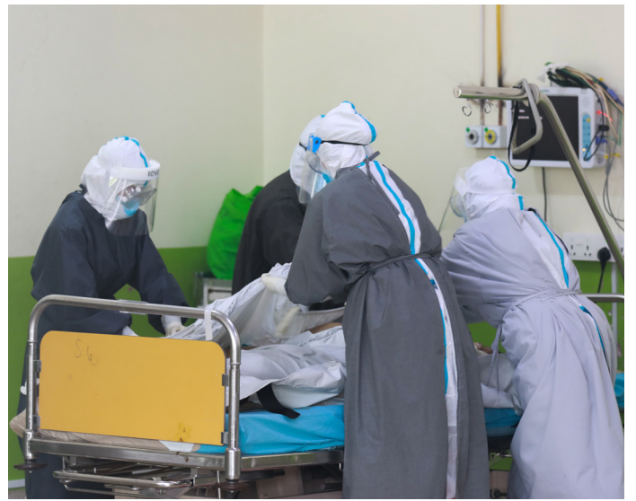
COVID dead body management, wrapping the body in plastic bag.