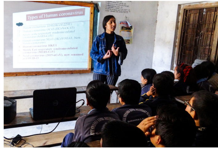
School awareness sessions on COVID-19 before lockdown started in Nepal.

Basic triage facilities have been set up in each outreach centers of Dhulikhel Hospital and personal protective equipment (PPE) have been provided to all staff for safety. Isolation facilities have also been set-up in three of our outreach centers. A 10 bed Isolation Center was set up in Bahunepati and a 5 bed Isolation Centers are set up in Dolakha and Kirnetar Outreach Centers. More than 20 cases have been quarantined and isolated in these Isolation Centers so far.