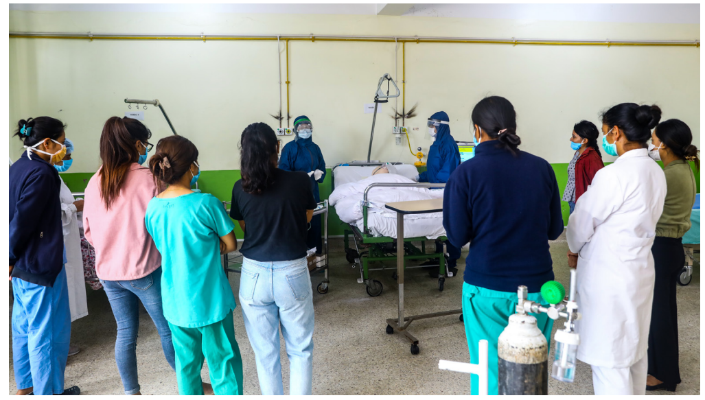
Simulation training on caring of ICU/Ventilator case

Training on effective use of PPE, use of social distancing and safety procedures has been provided to all staff. Hygienic staff and laundry staff were taught to follow the new safety procedures at the very beginning of the pandemic. All the staffs working in the frontline including Triage 1, Triage 2, Fever Clinic, ARI Zone, Emergency Department, RICU and Isolation Ward are given simulation classes before their respective duties. More than 1,000 staffs have been trained so far.