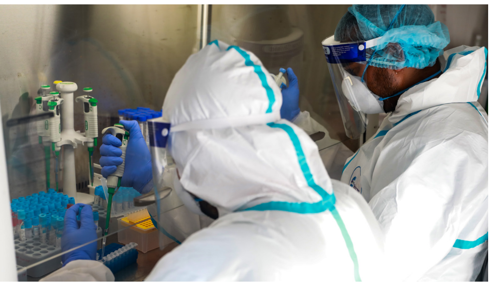
RT-PCR test in microbiology laboratory.

Dhulikhel Hospital started conducting COVID RT-PCR tests from March 23, 2020. Since then we have been routinely conducting RT-PCR tests for swabs collected in the hospital and local communities as well as for samples that are sent to us from hospitals and clinics all across Nepal. The hospital has activated a stand-by laboratory support to meet the surge in demand for testing. We have tested a total of 19,737 samples so far, out of which, 1,497 samples tested positive for COVID-19.