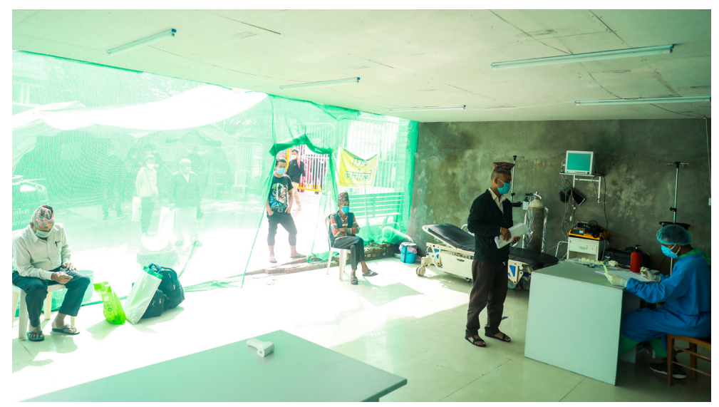
Patients in the Fever clinic.

Fever Clinic and ARI Zone was set up at the entrance of the hospital in order to prevent COVID suspected cases to interact with others in the hospital. A total of 579 cases have been treated in Fever Clinic and 22 cases have been treated in ARI Zone till now.