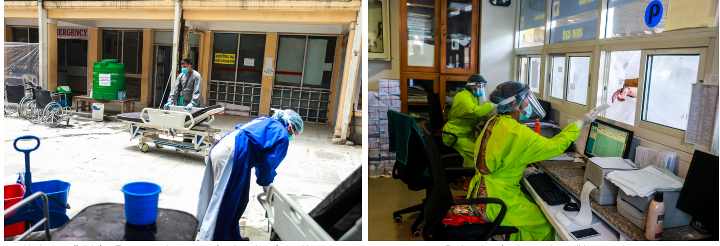
Hygienic staff disinfect Emergency department after detection of a positive case.

All academic classes of Kathmandu University School of Medical Sciences (KUSMS) are being conducted online. Although e-learning is challenging to both the teachers and the students, KUSMS has been continuously providing video lectures (live or recorded) and assignments for all the programs such as for medicine, nursing, public health, physiotherapy, A-levels. The institute is uploading lectures to Canvas and Moodle to remove access to barriers related to internet. The institute has adopted Zoom app and Google meet for lectures and interactive sessions. The institute is using trial and error and regular feedback collection methods to improvise the sessions.