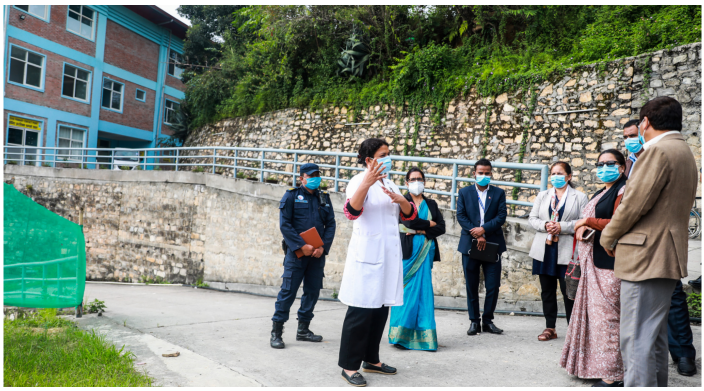
Officials from MoHP visit COVID Care Center of Dhulikhel Hospital.