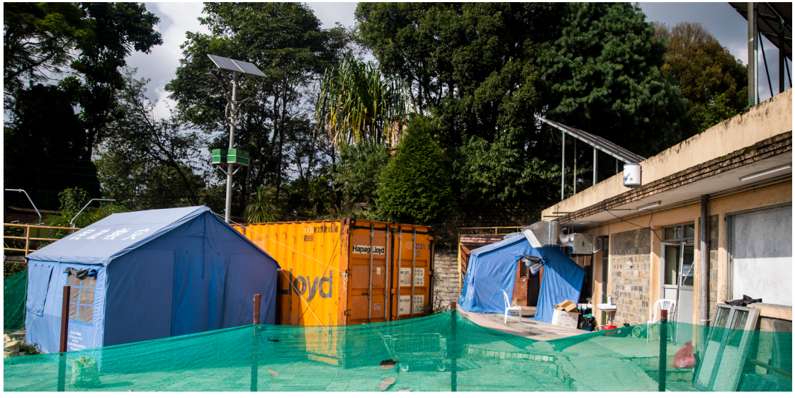
RICU set up in DH.