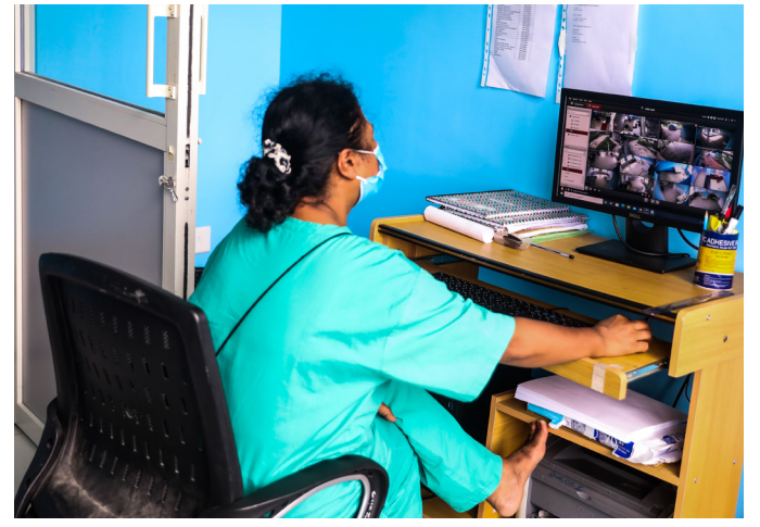
Monitoring of COVID cases through CCTV surveillance in COVID care center.