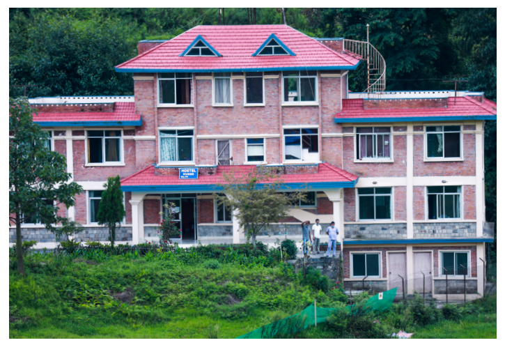
COVID positive staff in Isolation.