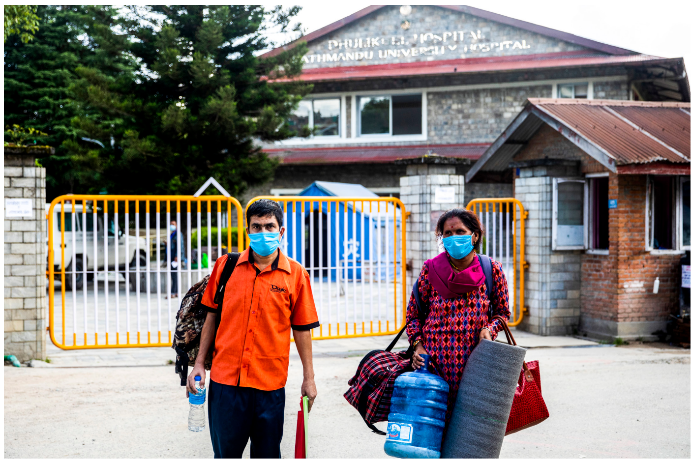
A COVID case heading home after 37 days of admission in Isolation unit including 7 days in ventilator.

We would like to thank all our partners, friends and well-wishers, who over the years, have supported us to achieve our mission. Dhulikhel Hospital was established with the idea of providing quality care to the needy and with your help, in the last two decades, we have been doing just that and more. With your help we have provided critical healthcare to millions of Nepalis in need at an affordable cost. We have provided free healthcare to hundreds of thousands of people. And our livelihoods and community development activities have directly or indirectly affected thousands of families in communities throughout Nepal. In this very challenging time, we need our partners and friends more than ever before for support and partnership. We know that our services are precisely what is needed at the moment as we continue to save lives. If you would like to be a part of our journey to make a difference in the lives of vulnerable people who need us the most at this critical juncture, please do contact us.