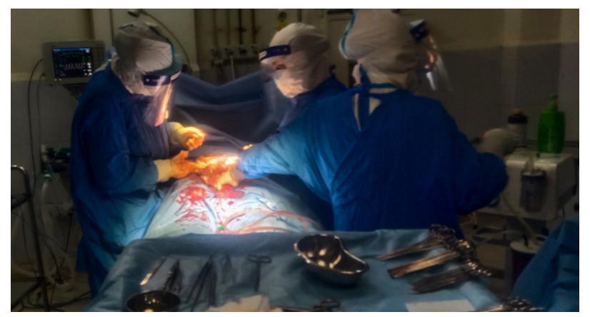
Caesarian Section delivery of of a confirmed COVID pregnant lady in COVID Care Center.

One of our outreach centers Gaurisankar Hospital, Dolakha has started functioning, even during the time of crisis. Several deliveries have been conducted there, including a Caesarian Section on August 22nd, 2020.