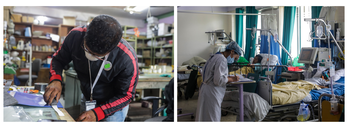
Maintenance staff producing a faceshield.

A Rapid Response Team (RRT) was formed to work exclusively on case based COVID-19 surveillance at the hospital and local communities. This team conducts case-based reporting to the local government within 24 hours of case detection, conducts periodic risk assessment to inform strategic and operational aspects of the response interventions and creates and disseminates epidemiological reports. Effective evidence based surveillance and follow-up of asymptomatic travelers and contacts of positive cases are being done. More than 148 staffs involved in treatment of COVID positive cases have been guarantined.