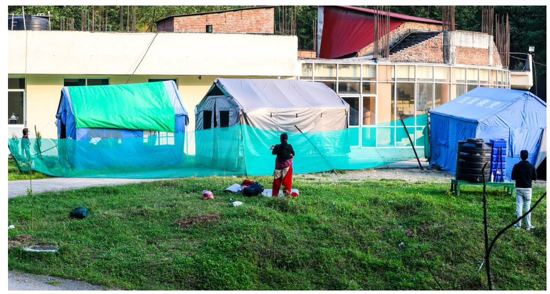
Suspected case in the process of entering the Isolation unit.