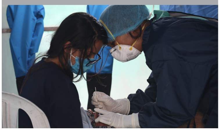
Sample collection for RT-PCR test of the baby of Nepal's first COVID related mortality.