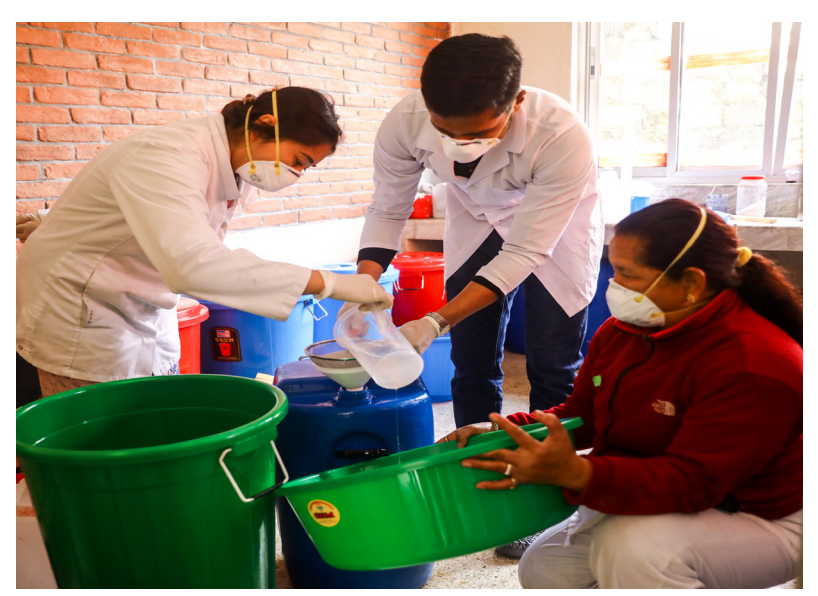
Hand sanitizer and disinfectant production.