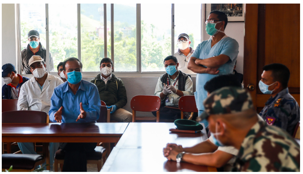
Stakeholder meeting led by Aministrative Director of the hospital to report and plan further

Dhulikhel staff started discussing the potential risk of COVID and required preventive measures from January of 2020. On February 11, 2020, a basic triage was set-up at the reception. Key messages for awareness and prevention methods to public and case detection and management methods to staff were and are continually being developed, revised and disseminated. Screening campaigns targeting the general and vulnerable populations have also been launched in coordination with local government and non-government bodies.