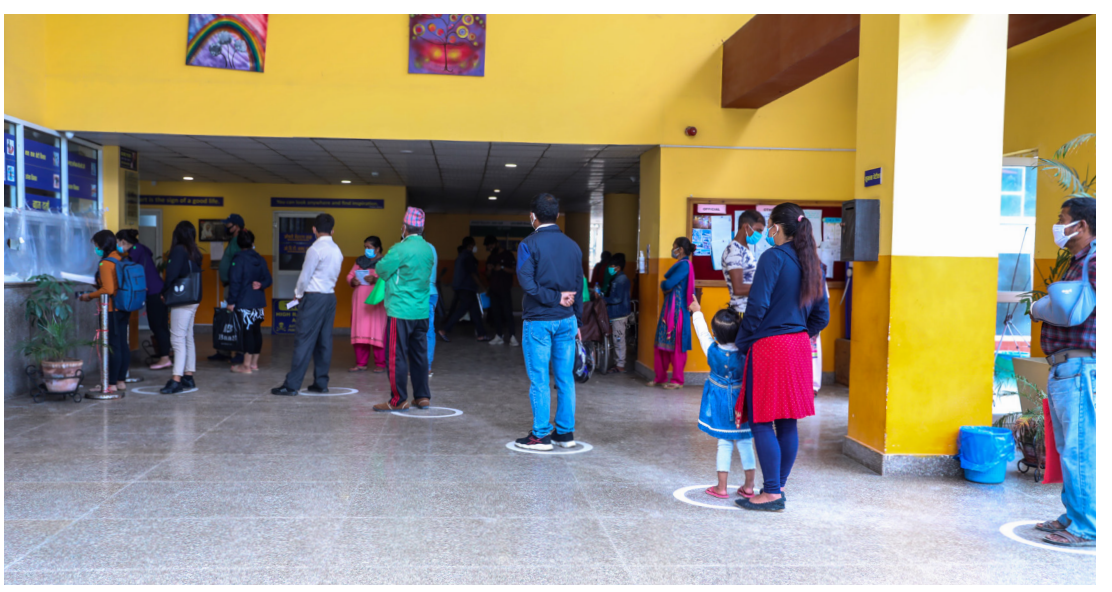
Patients queuing up by maintaining physical distance for the hospital registration followed by outpatient check up.

Strict safety procedures are followed in the hospital. In addition to triage, maintaining safe physical distance in crowded areas is encouraged. All staffs working in every department including those working in the frontlines are provided with adequate personal protective equipment (PPE). Disinfection and cleaning is done after each procedure in OPD and Emergency departments.