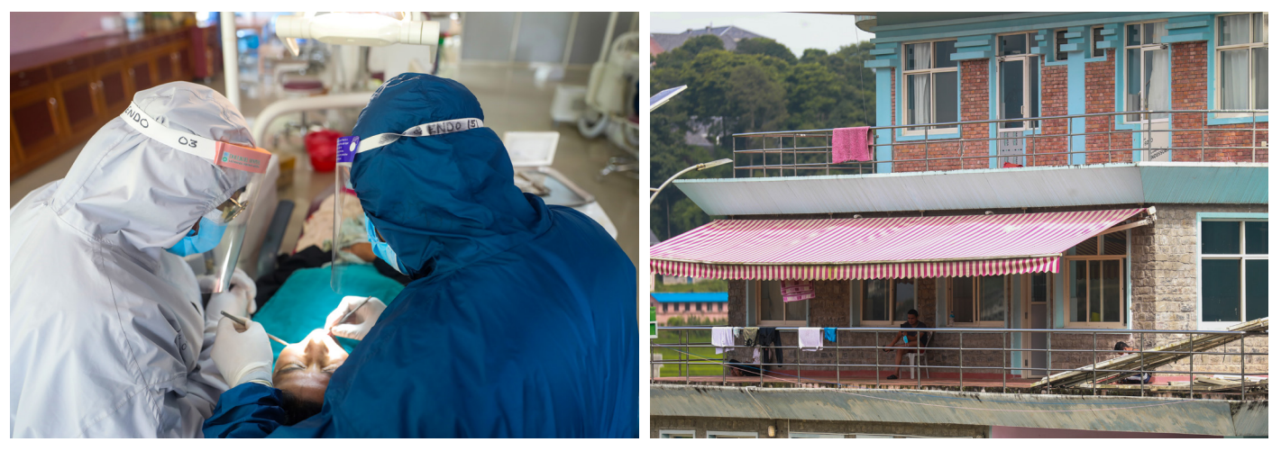
Dental services using faceshields prepared by the students of dental department.