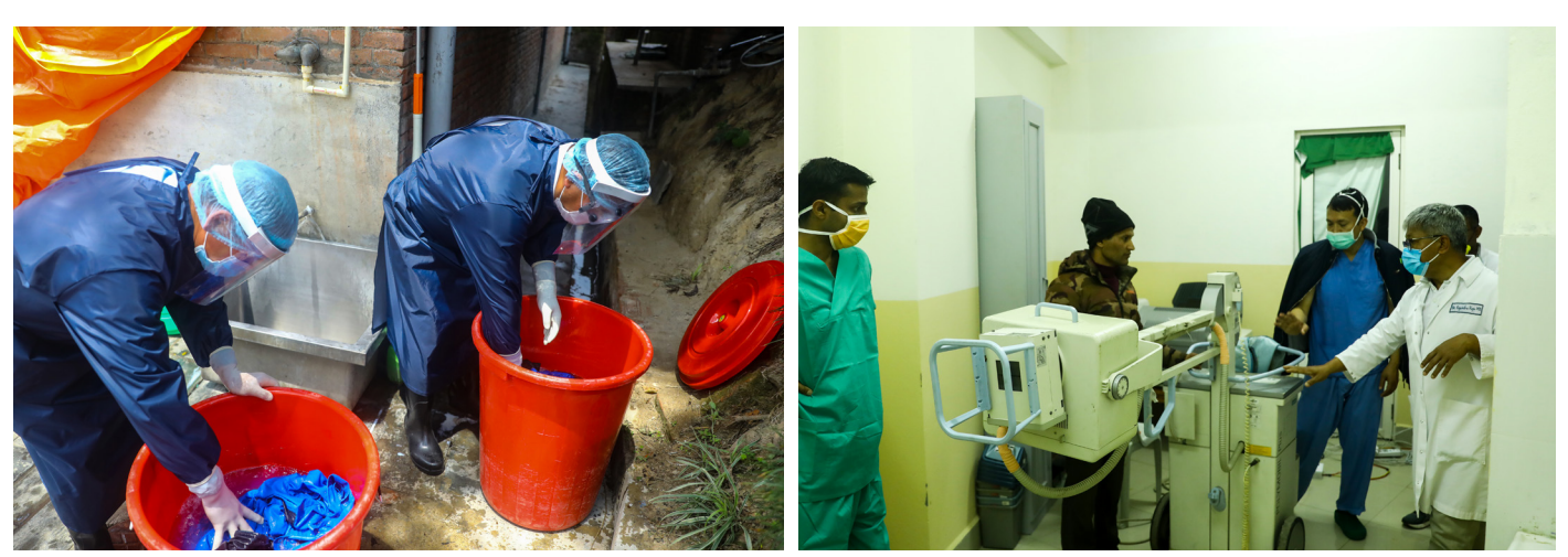
Infected clothes being disinfected before the regular laundry.

We have been promoting intensive hygiene, respiratory etiquette and overall water, sanitation and hygiene (WASH) at the hospital for containment and protection in priority locations. Masks, gloves, sanitizers as well as face shields, PPEs are being provided to all relevant staff. Regular technical guidance on reinforcing infection control measures within facilities, including triage flow and segregation of suspected, possible and confirmed cases has been provided to all staff. The guarantine and isolation facilities have been established following a strict hygiene and sanitation protocol. The surveillance and follow-up for acquired infection by health care workers exposed to probable and confirmed COVID-19 cases are immediately done.