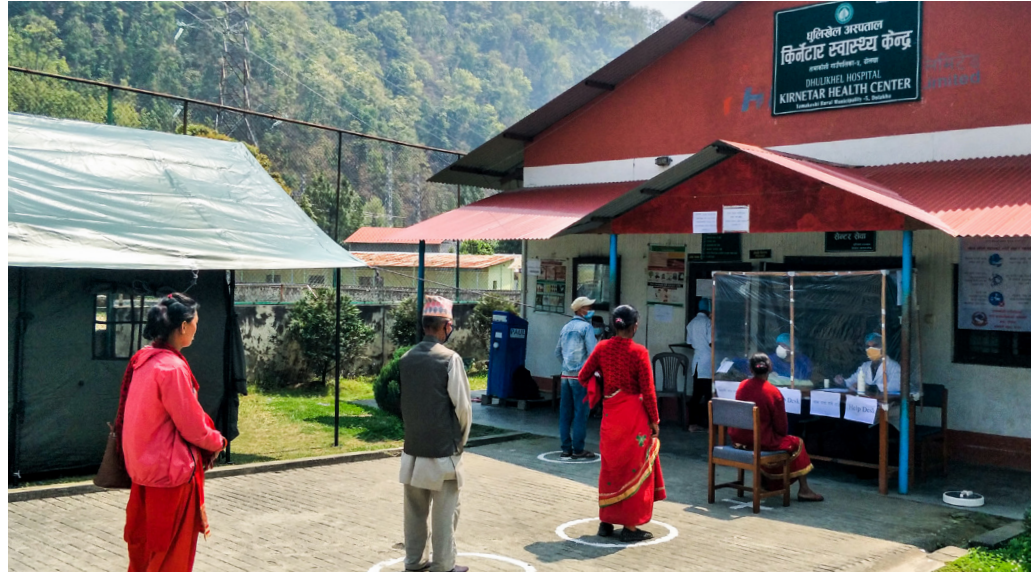
Triage in Kirnetar Outreach Center

Basic triage facilities have been set up in each outreach centers of Dhulikhel Hospital and personal protective equipment (PPE) have been provided to all staff for safety. Isolation facilities have also been set-up in three of our outreach centers. A 10 bed Isolation Center was set up in Bahunepati and a 5 bed Isolation Centers are set up in Dolakha and Kirnetar Outreach Centers. More than 20 cases have been quarantined and isolated in these Isolation Centers so far.