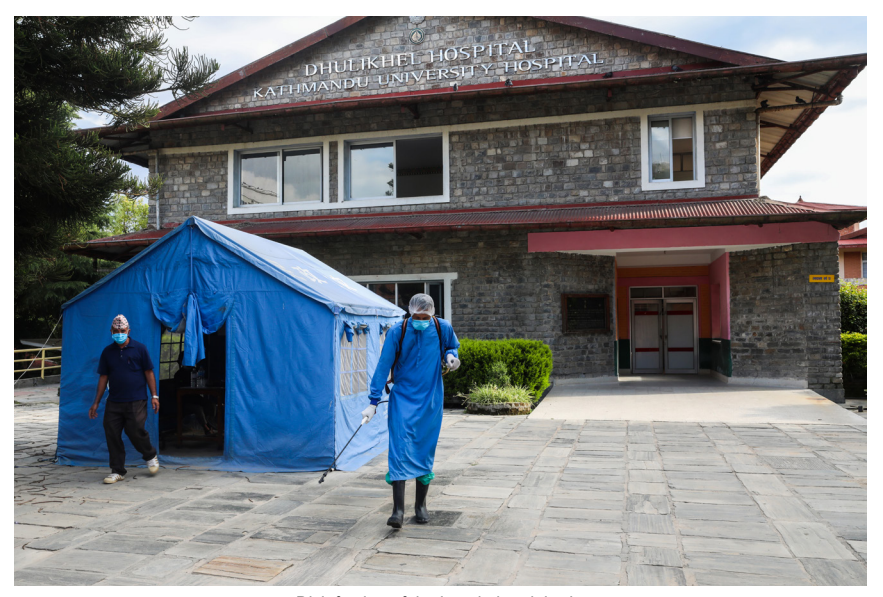
Disinfection of the hospital peripheries.

We have been promoting intensive hygiene, respiratory etiquette and overall water, sanitation and hygiene (WASH) at the hospital for containment and protection in priority locations. Masks, gloves, sanitizers as well as face shields, PPEs are being provided to all relevant staff. Regular technical guidance on reinforcing infection control measures within facilities, including triage flow and segregation of suspected, possible and confirmed cases has been provided to all staff. The guarantine and isolation facilities have been established following a strict hygiene and sanitation protocol. The surveillance and follow-up for acquired infection by health care workers exposed to probable and confirmed COVID-19 cases are immediately done.