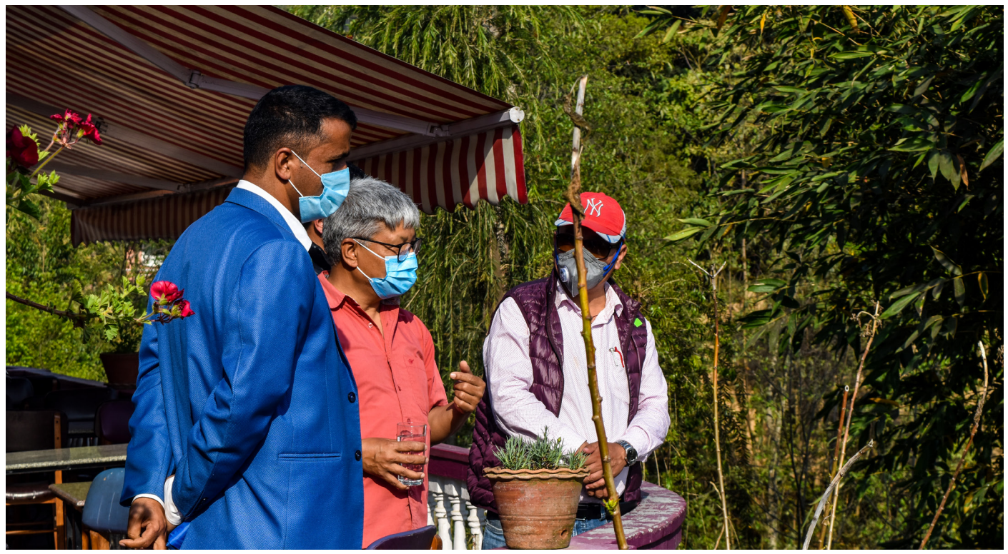
Honorable social development minister of Province 3- Mr. Yubraj Dulal observing the isolation unit of Dhulikhel Hosptal.