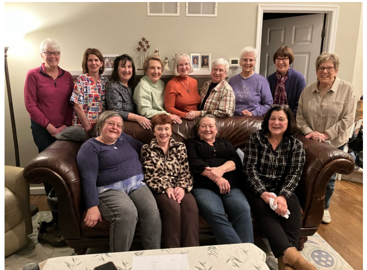
The Grateful Ladies of Zion Bunco Game Night

Social Ministry asks that you please donate blood in Zion’s name at the Central PA Blood Bank donor center “The Blue Barn” on 475 W Governor Road Suite 4 Hershey, PA 17033. When donating please provide our donation number 129. Contact them at 717-298-6256, they are open Monday-Friday 7:30 am -5:30 pm and Sundays from 8:00 am - 12:00 pm.