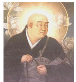
Founder of Jodo Shu : Honen Shonin (1133-1212)

Chutoba is available for this Gyoki service. At this service you may also honor your deceased ancestors with a Chutoba prayer. See above for the Chutoba order form.