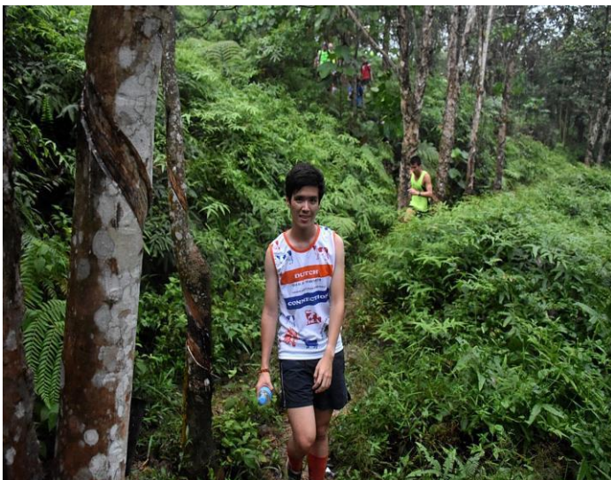
In a rubber plantation

Alternatively, wherever you are in the world, just search hash house harriers near me; there probably is one not too far away.