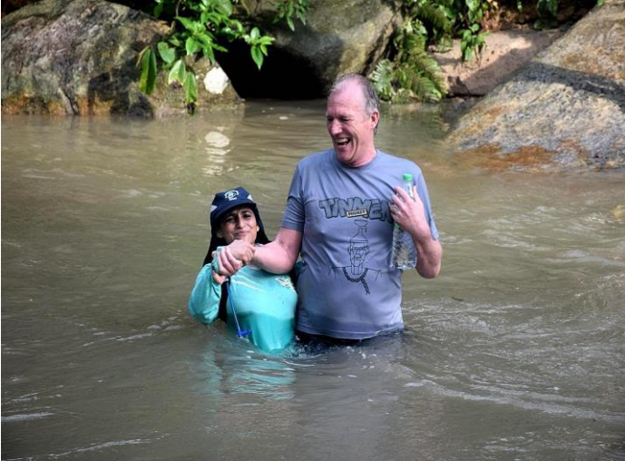
The check was across this river. Quite deep if you're a small Asian girl.