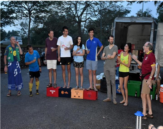
All those muddy hills now seem worthwhile