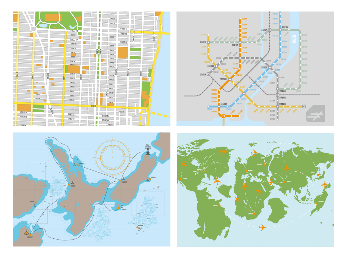
Figure 3: Example of the four-map representation in Mission Career evaluations

The maps and their various design elements symbolise the individual types. The maps stand for the group of specific strengths that characterise the respective personality type. These maps represent the environment in which a person will feel comfortable and be able to evolve. They give clues as to how to set personal goals as well as the ways of moving forward in life.