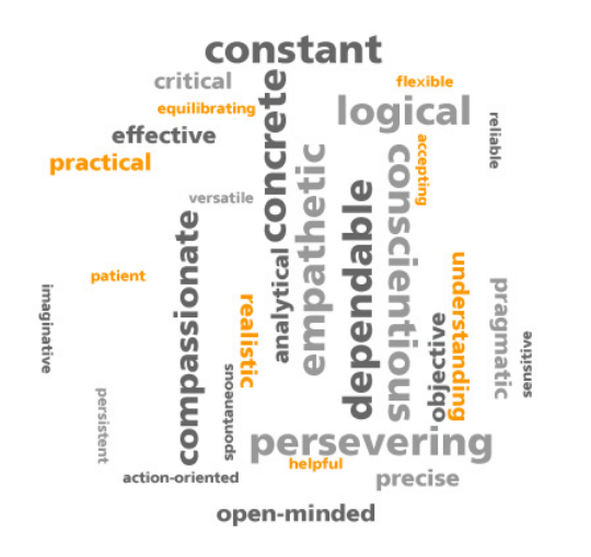
Illustration 4: Word cloud

Feedback provided in the form of a word cloud (see illustration 4) conveys the most detailed analysis of the VIP.