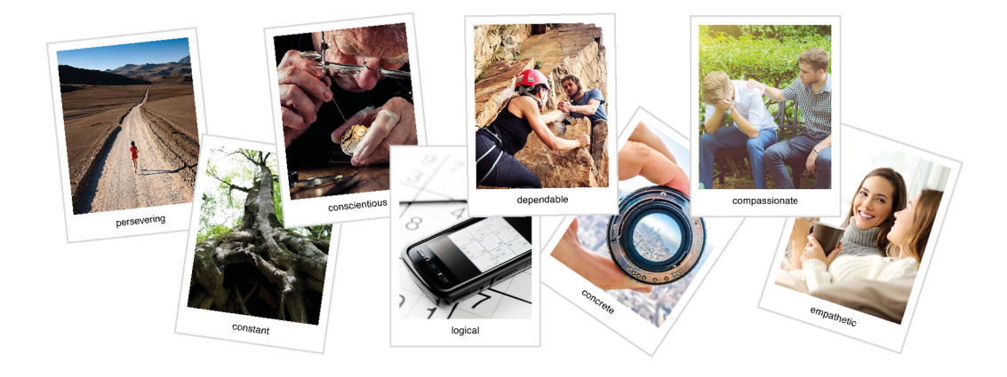
Illustration 5: Photograph illustrating a strength (Mission Career)

Eight adjectives listed in the word cloud are printed in particularly large type. These are the strengths that the report would like to highlight for the respondent. Reports come with a photograph in Polaroid format illustrating these particular adjectives. Illustration 5 shows some strength photographs.