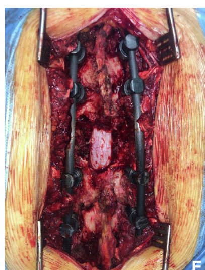
Fig. 1. Male, 61 years old. T11 NSCLC metastases with high grade epidural compression and paraparesis. (A,B) A dorso-lumbar fixation with CFR-PEEK implants and circumferential decompression were performed. (C,D,E) At the last follow-up (8 months) a total neurological recovery was observed.

Please cite this article as: F. Cofano, G. Di Perna, M. Monticelli et al., Carbon fiber reinforced vs titanium implants for fixation in spinal metastases: A comparative clinical study about safety and effectiveness of the new "carbon-strategy", Journal of Clinical Neuroscience, <a href="https://doi.org/10.1016/j.jocn.2020.03.013">https://doi.org/10.1016/j.jocn.2020.03.013</a> Downloaded for Anonymous User (n/a) at Tel Aviv Sourasky Medical Center from ClinicalKey.com by Elsevier on March 17, 2020. For personal use only. No other uses without permission. Copyright ©2020. Elsevier Inc. All rights reserved.