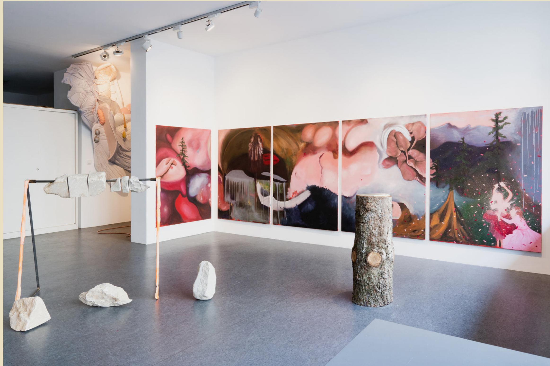
Installation view of "Das Rauschen" 2021, 140 x 500 cm, 5-piece, oil on canvas