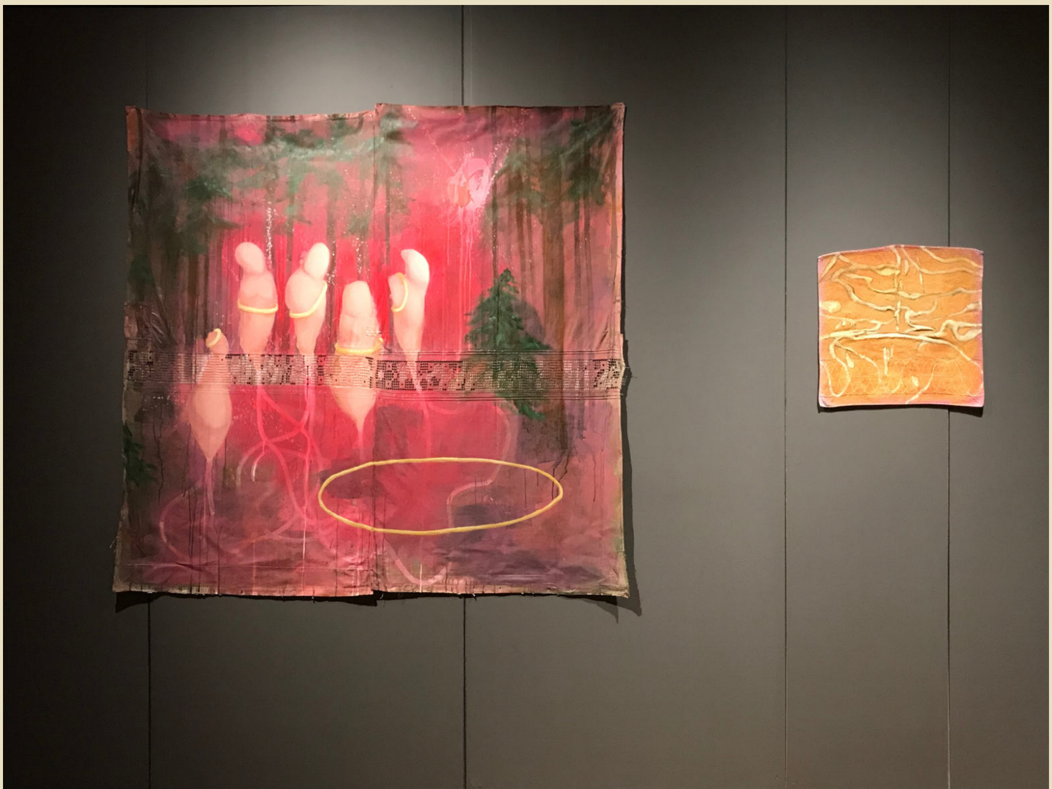
"Mycel 9" 2021, 155 x 158 cm, oil on bedlinen