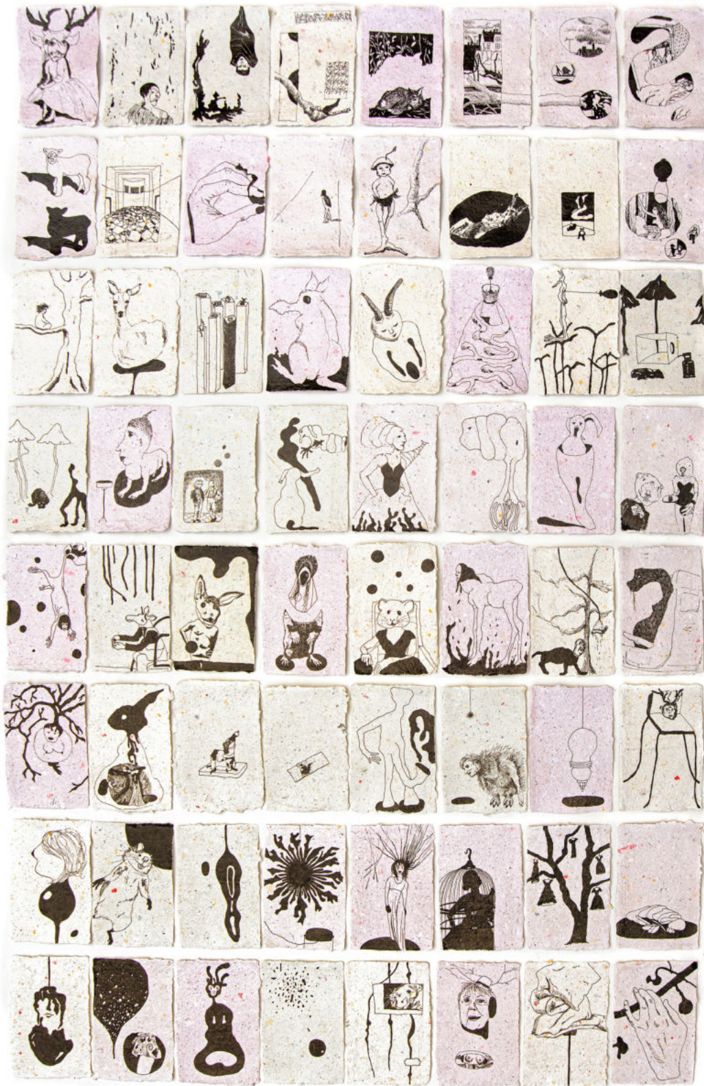
"Sketchbook project" 2020, 64-piece, each 22 x 14,5 cm, ink on handmade paper (64 newly created sketches from 6 of my sketchbooks of different years) awarded with the Aichach Art Prize 2021