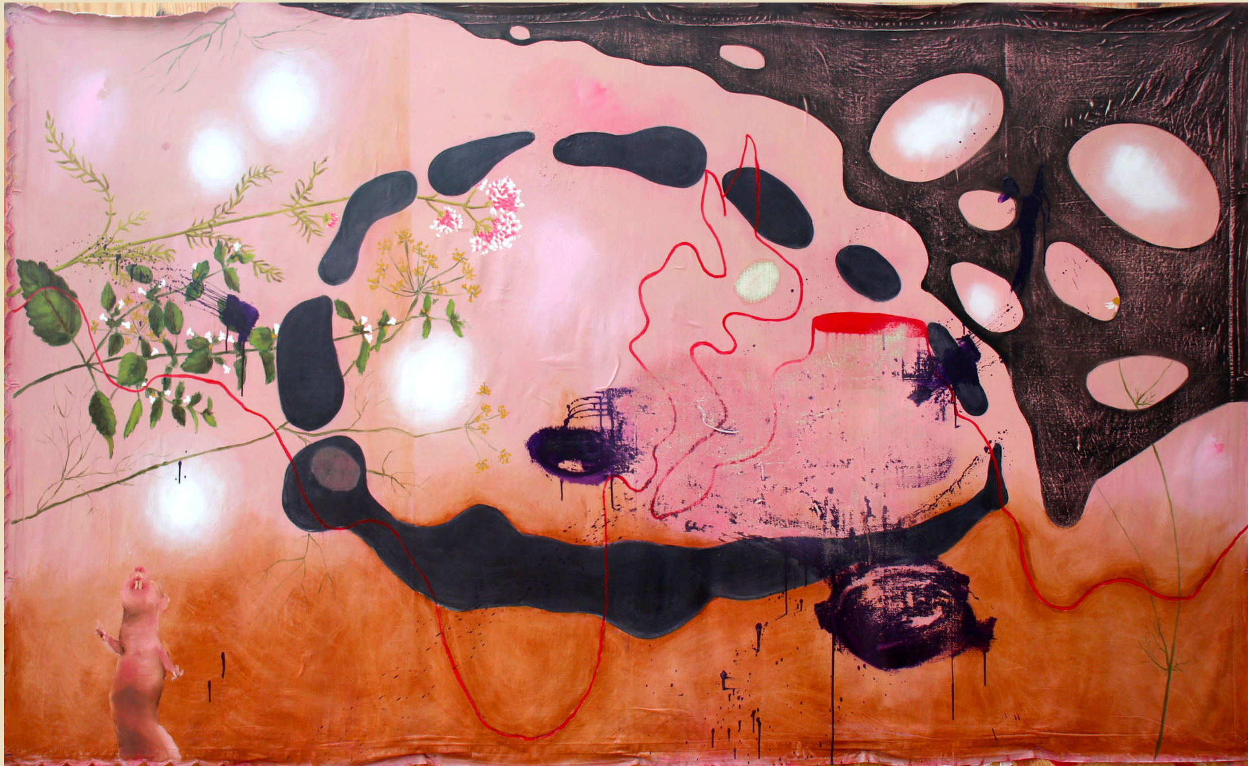
"Visualisation study of a sleeping sensation" 2022, 142 x 235 cm, acrylic & oil on bedlinen