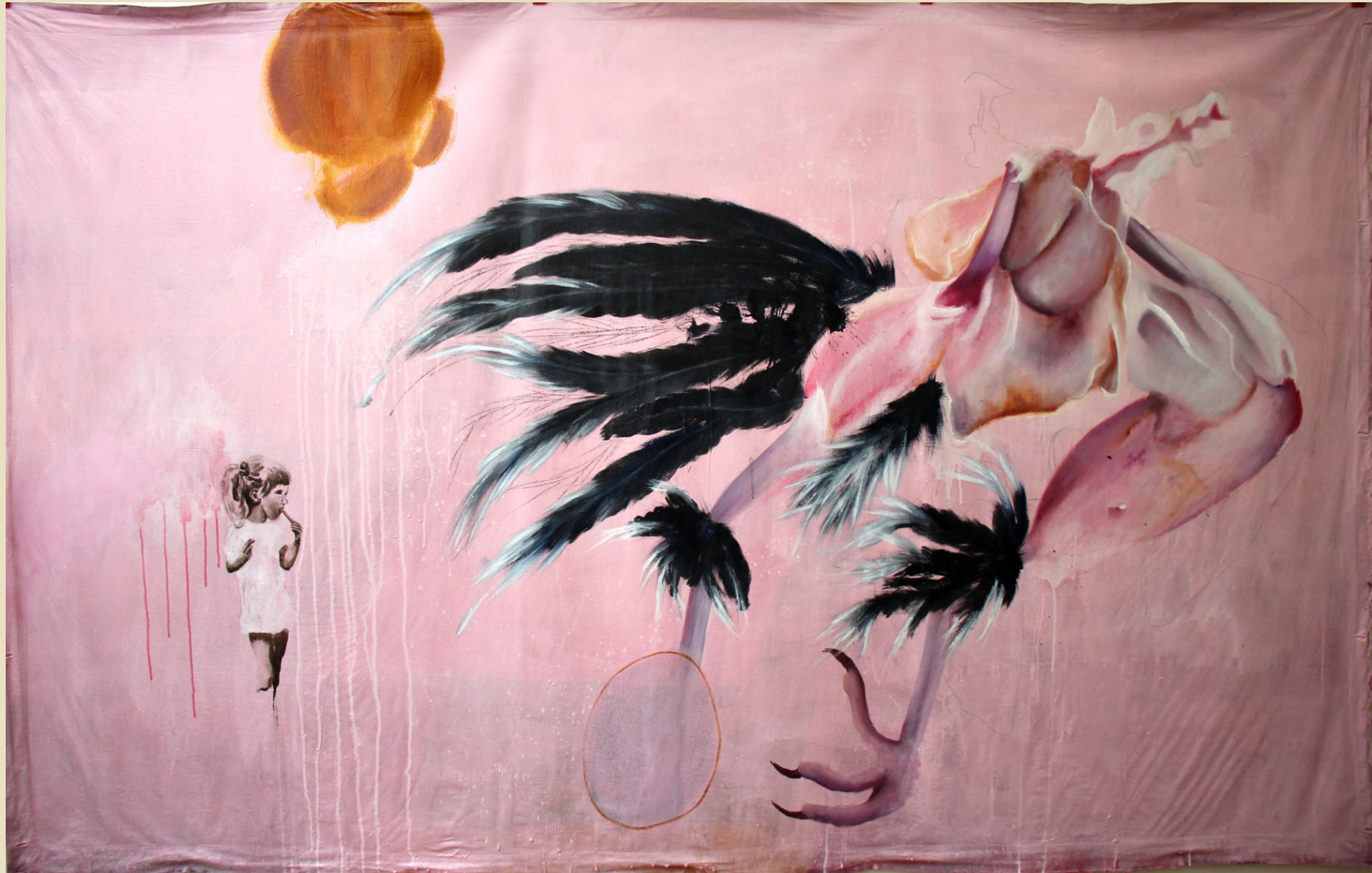
"Memory distortion" 2022, 145 x 235 cm, acrylic & oil on bedlinen