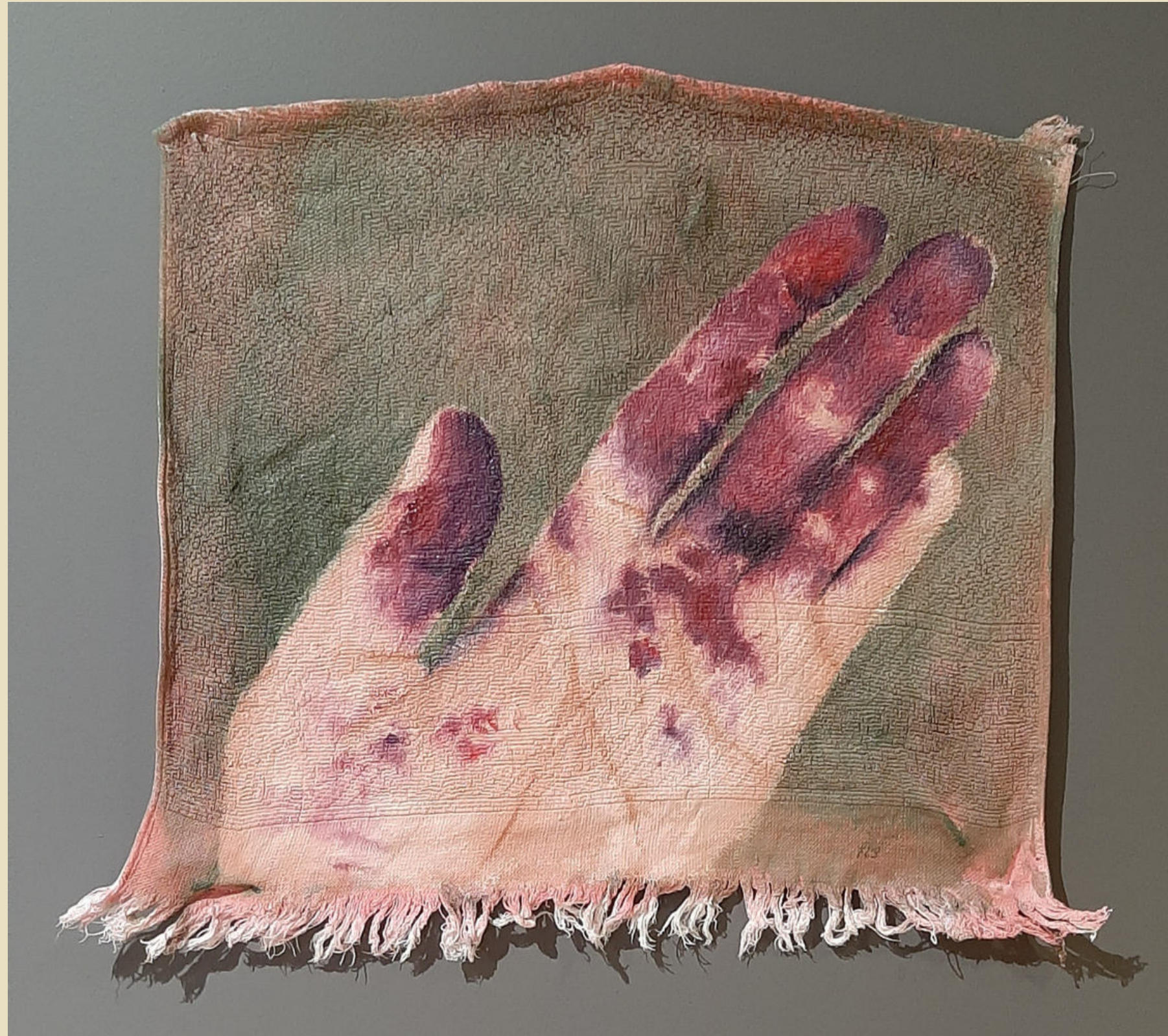
"Mycel 6" 2021, 43 x 45 cm, oil on towel