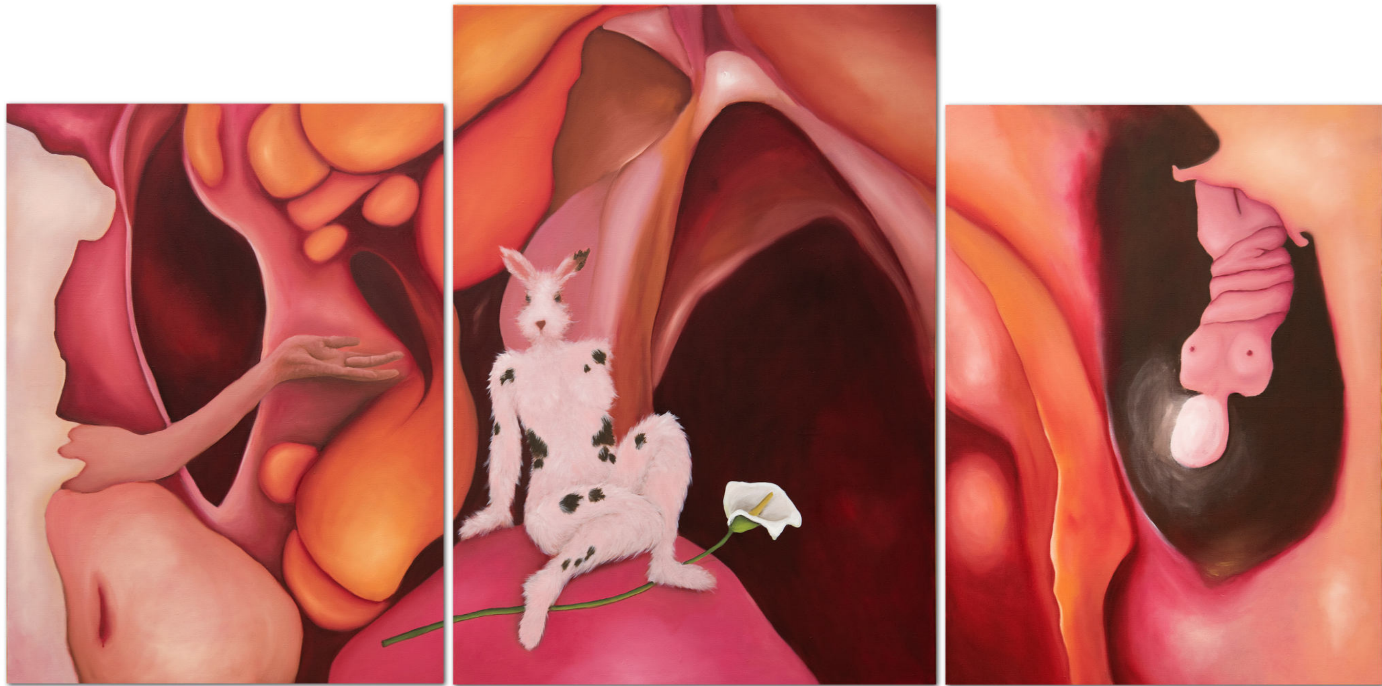
"Condition Mapping" 2021, 140 x 280 cm, 3 parts, oil on canvas