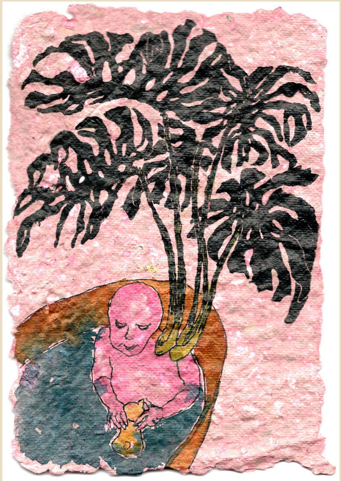
Series "Heroines" 2020, 15 x 20 cm, ink and indian ink on handmade paper