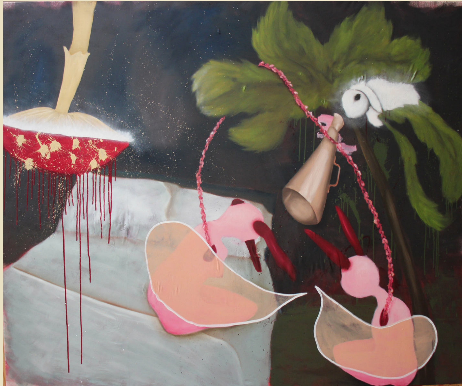
"Night Walk" 2021, 165 x 200 cm, oil on bed sheet