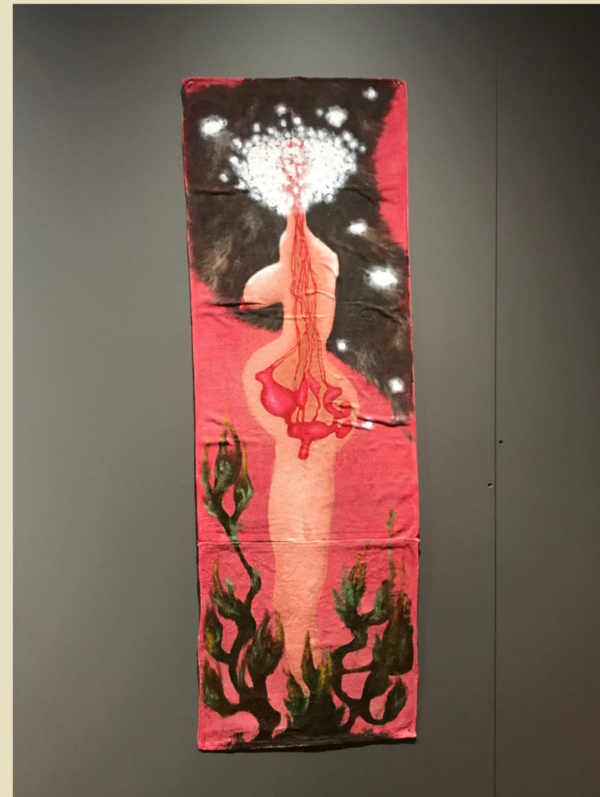
"Mycel 5" 2021, 135 x 45 cm, oil on towel