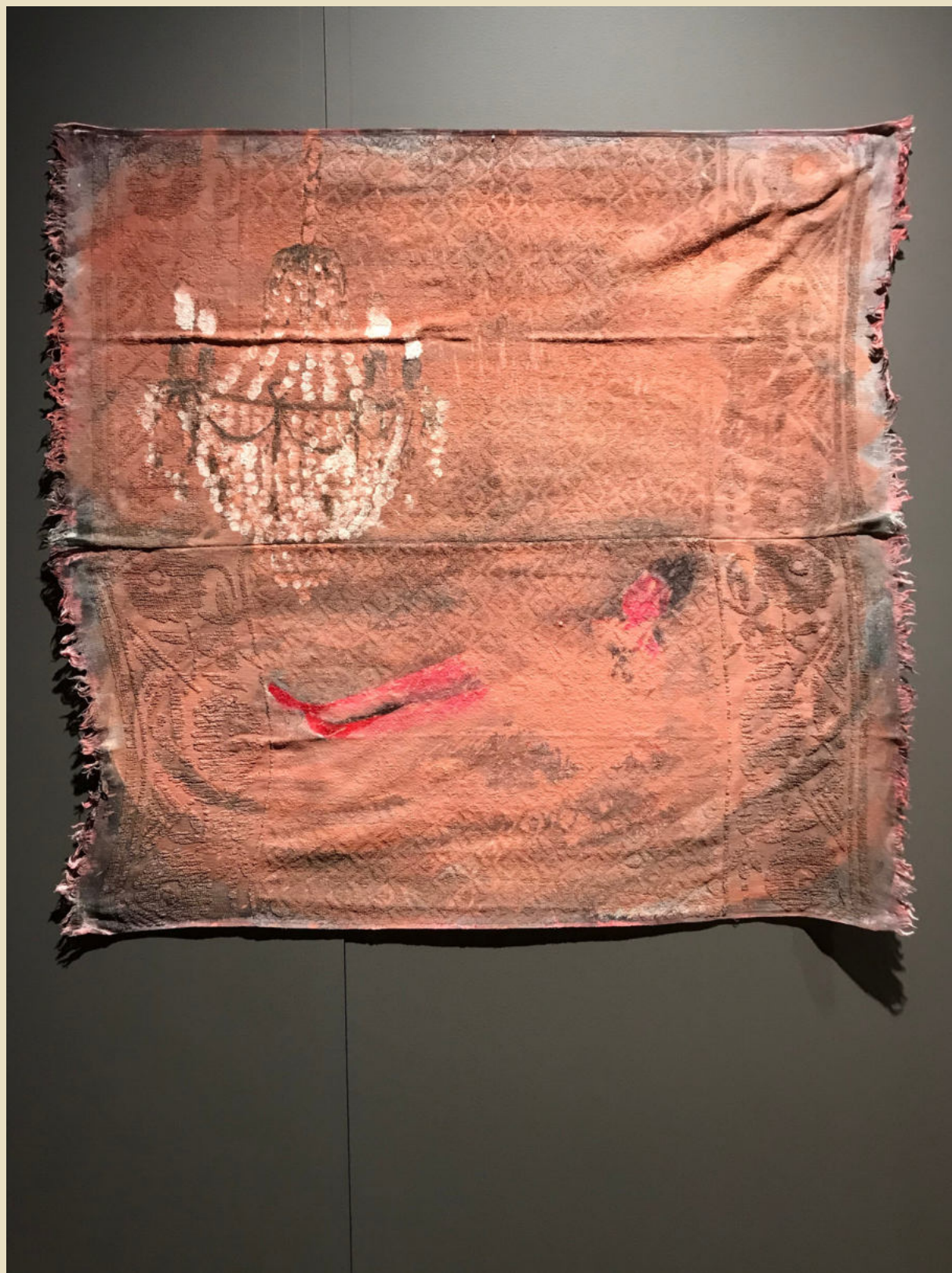
"Mycel 4" 2021, 86 x 91 cm, oil on towel