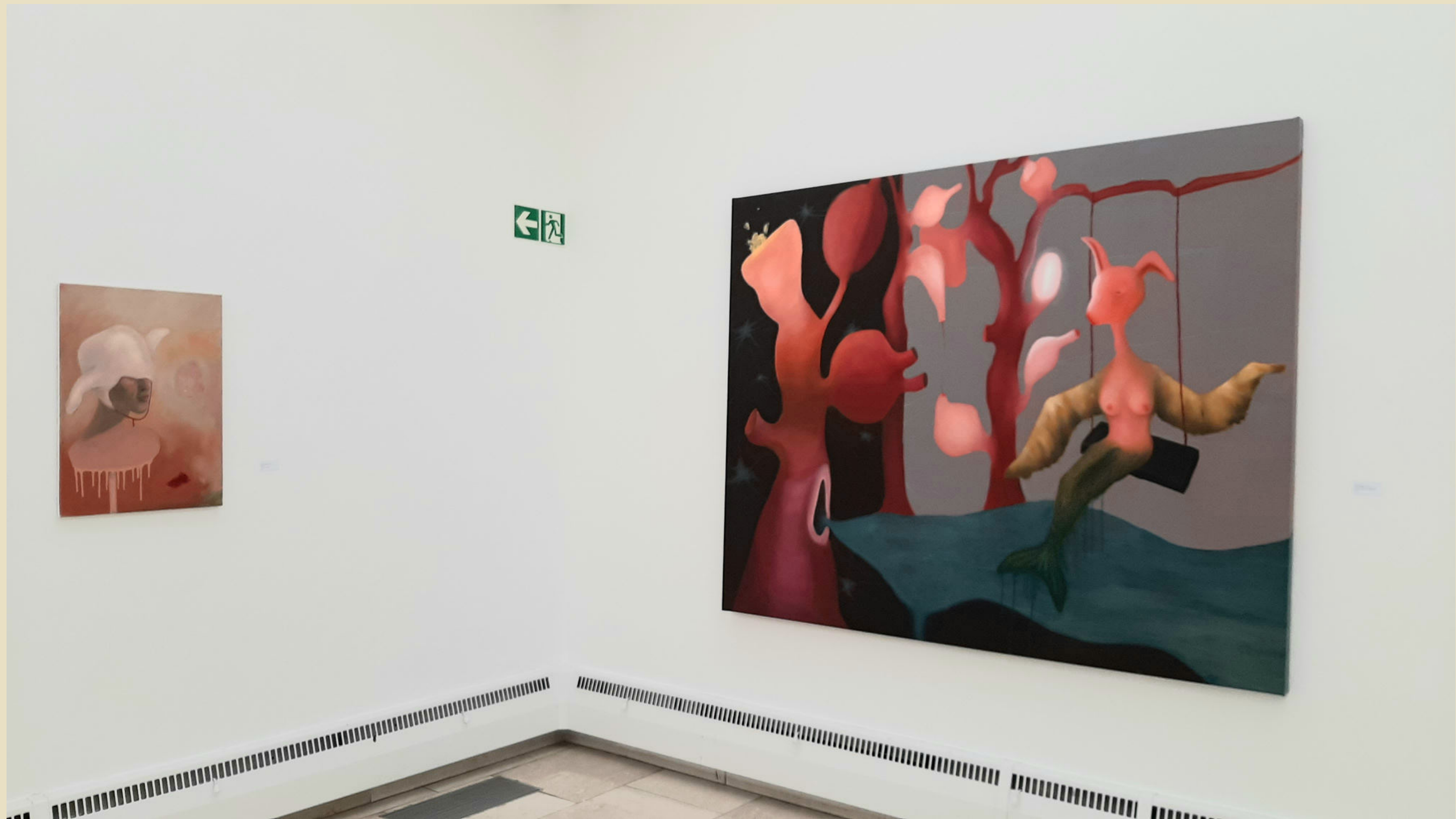
Exhibition view Kunstverein Rosenheim: (left) "Tosca" 2019, 70 x 50 cm, oil on canvas; (right) "The Dialectical Memory" 2020, 160 x 200 cm, oil on canvas