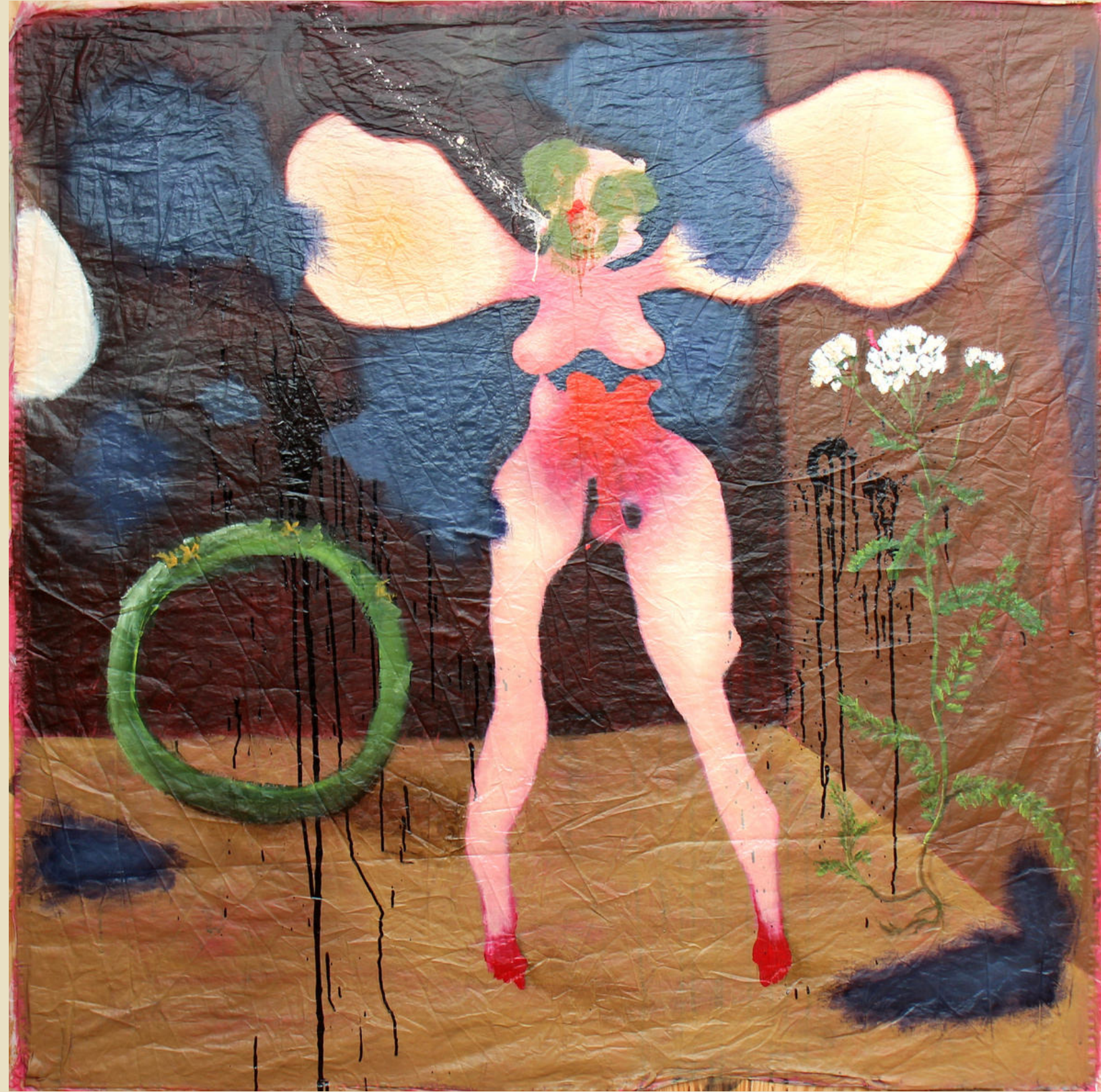
"Split Wing Figure" 2022, 140 x 140 cm, acrylic & oil on curtain