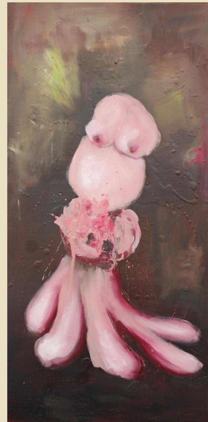
"Condition I - III" 2021, 85 x 65 cm, 20 x 20 cm and 60 x 30cm, oil on canvas