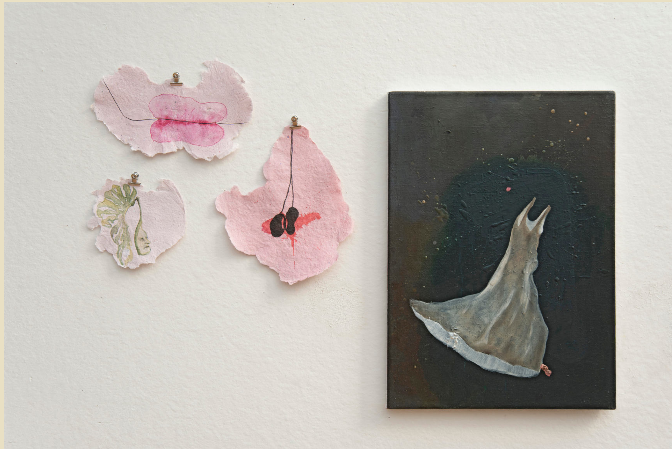
Installation view from: Left: from the series "the dialectical memory" 2020, Ink & ink on handmade paper, various sizes. Dimensions Right: "night shirt" 2019, 55 x 40 cm, oil on canvas