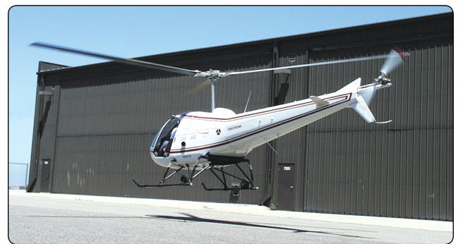
Figure 8-2. Exercise extreme caution when hovering near buildings or other aircraft.

Another rotor safety consideration is the thrust a helicopter generates. The main rotor system is capable of blowing sand, dust, snow, ice, and water at high velocities for a significant distance causing injury to nearby people and damage to buildings, automobiles, and other aircraft. Loose snow, sand, or soil can severely reduce visibility and obscure outside visual references. There is also the possibility of sand and snow being ingested into the engine intake, which can overwhelm filters and cutoff air to the engine or allow unfiltered air into the engine, leading to premature failure. Any airborne debris near the helicopter can be ingested into the engine air intake or struck by the main and tail rotor blades.