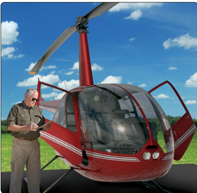
Figure 8-1. The pilot in command is responsible for the airworthy condition of the aircraft and using checklists to ensure proper inspection of the helicopter prior to flight.

Title 14 of the Code of Federal Regulations (14 CFR) requires that all aircraft instruments and installed equipment be operative prior to each departure. However, when the Federal Aviation Administration (FAA) adopted the minimum equipment list (MEL) concept for 14 CFR part 91 operations, flights were allowed with inoperative items, as long as the inoperative items were determined to be nonessential for safe flight. At the same time, it allowed part 91 operators, without an MEL, to defer repairs on nonessential equipment within the guidelines of part 91.