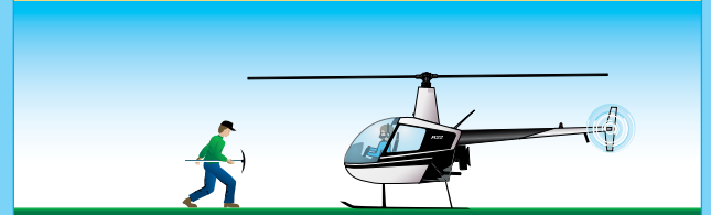
Figure 8-3. Safety procedures for approaching or leaving a helicopter.

Carry tools, etc., horizontally below waist level—never upright or on the shoulder.