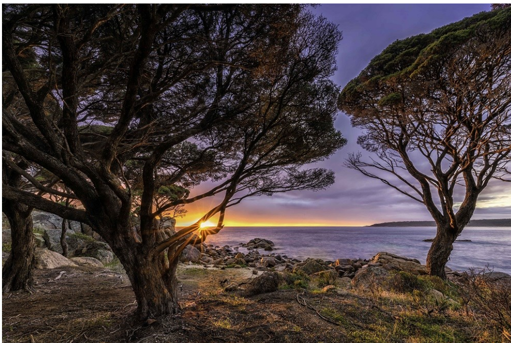
Shelly Cove near Bunker Bay, Cape Naturaliste