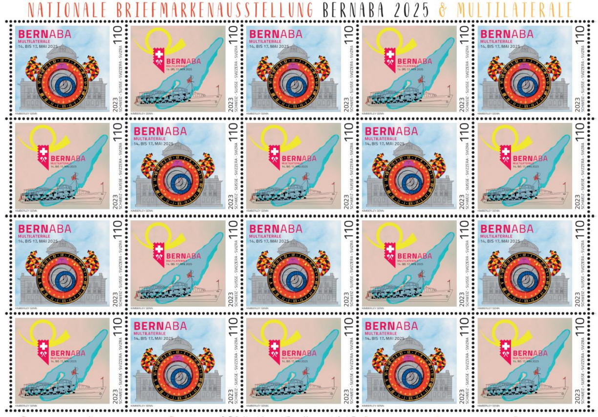
Exposition Nationale de Timbres BERN 14.-17. Mai 2025 Esposizione Nazionale di Francobolli