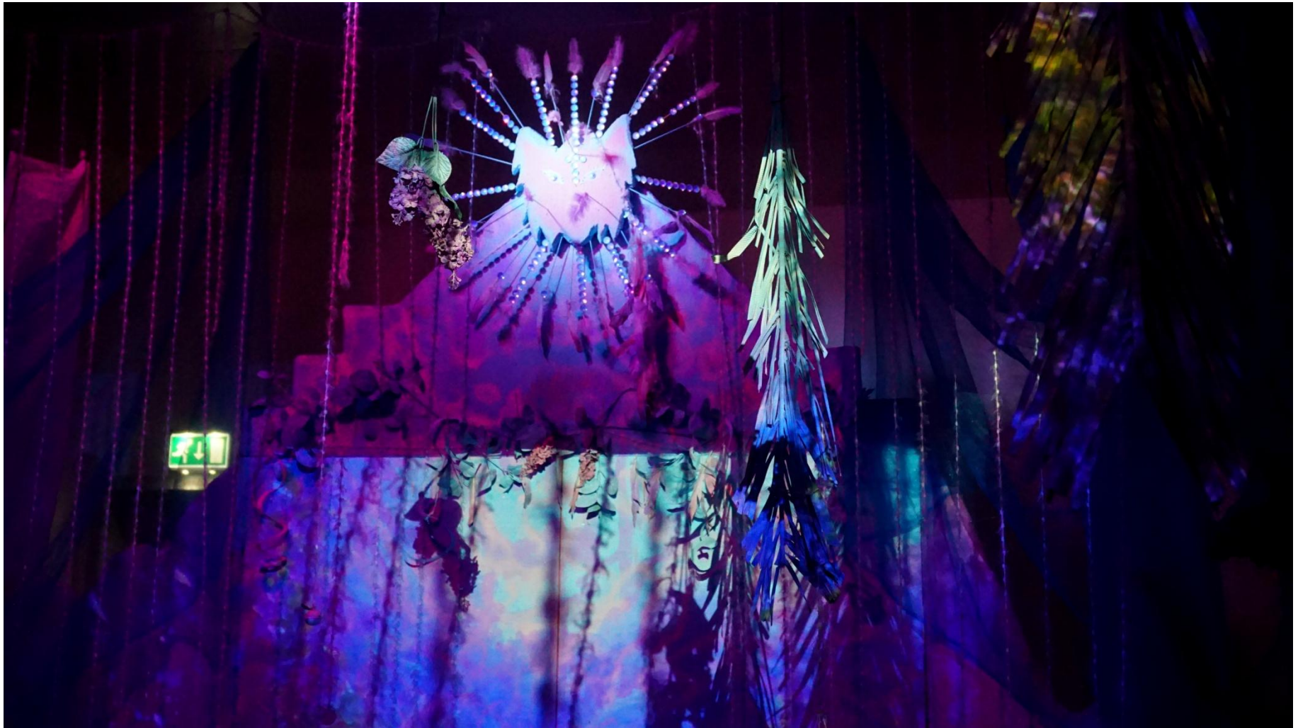
Ethereality 2019 – Mixed media installation - 12x5 meters Candles, sand, stones, fabric, branches, wool, Styrofoam , feathers Detail of video projection on sculptures and daily materials.