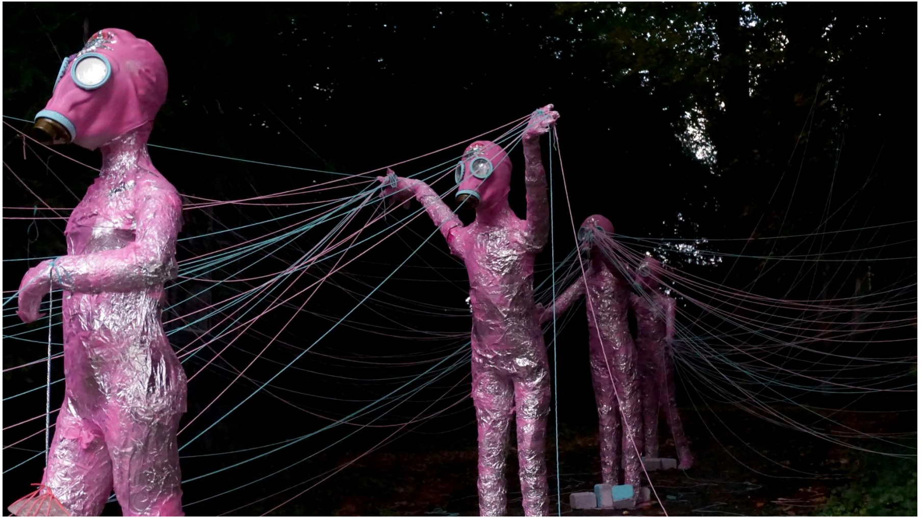
Canis lunatic, 2019 – Sculpture installation – at group exhibition Kloosterdagen Wittem NL

Wool, tinfoil, masks, stones, glitters, mannequins