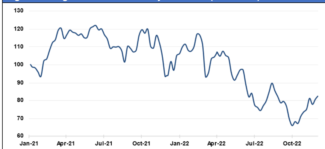
Figure 5: Pangolin Aviation Recovery Fund NAV (USD/share)