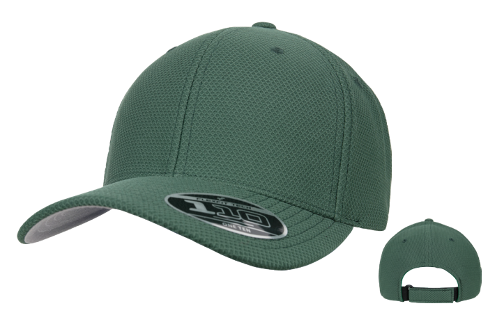
Snapback D-Ring Hook & Loop

Cool colors, sophisticated fabric: this strong Flexfit-Cap combines classic look with an enlightening style boost thanks to the fresh diamond pattern of the fabric. It comes with a cutting-edge curved visor, decorated with stylish seams, white underside and a handy Flexfit-Closure out of enfolding Velcro. Enjoy maximum wearing comfort without sacrificing a casual look!