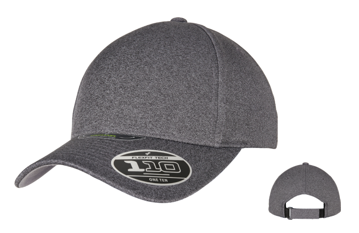
D-Ring Hook & Loop

The masculine cap is a flexible allrounder in form, color and function. It enters the fashion stage mottled and with an undervisor in contrasting color. The visor itself is pre-curved and eightfold quilted. An eye-catcher is the seamless front panel. Tried-and-tested Flexfit 110 technology and a handy Velcro fastener offer an optimum fit. The 110 Melange Unipanel cap – a street accessory that always fits.