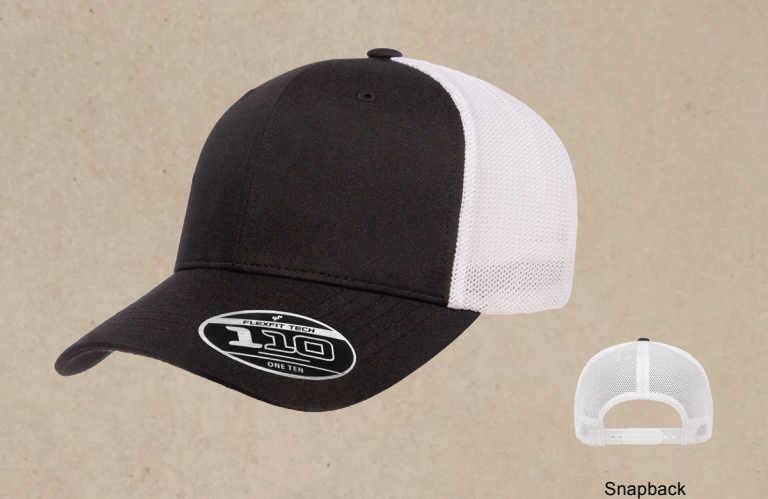
Trucker mesh caps made with recycled plastic bottles. 6-panel structured cap with matching undervisor. Matching plastic snapback closure with 8 rows of stitching on visor. Comes in 2-Tone. Adjustable + Flexfit® Technology.