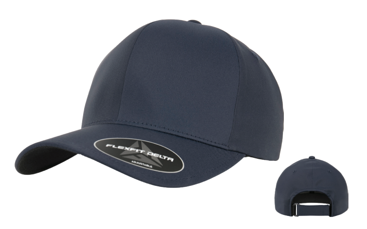
D-Ring Hook & Loop

The Flexfit Delta is a revolutionary cap that is the lighter, sleeker, smarter and more comfortable choice. It fuses panels with a seamless, stich-free finish and it couples a lightweight visor fabrication with a new 3-Layer multifunction sweatband. There is even patent-pending stain block tech that prevents sweat staining on the caps crown. On the back there is a highquality Velcro closure for stepless size regulation.