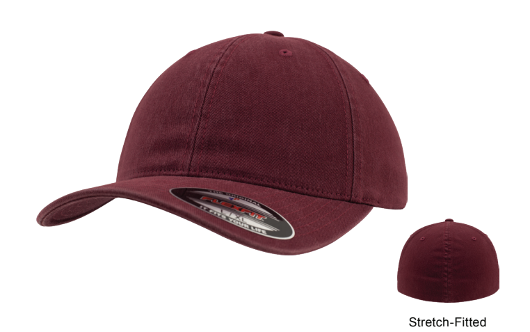
Retro dad cap style. Garment washed, 6-panel lightly structured cap with matching undervisor. Flexfit® fitted cap for style and

comfort. 8 rows of stitching on visor. FLEXFIT THE ONE AND ONLY ORIGINAL®.