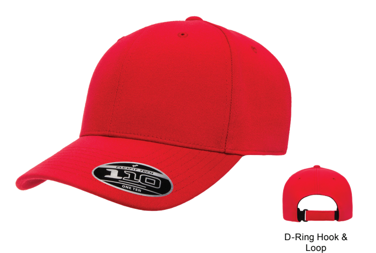
Lightweight cap with moisture-wicking and water repellent abilities. 6-panel structured cap with matching undervisor. D-ring hook and loop closure with 8 rows of stitching on visor.