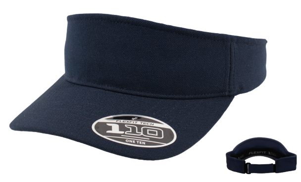
D-Ring Hook &

Mini pique, Cool & Dry fabric. Elastic flexloop attached to hook & loop closure for unparalleled comfort. 6 rows of stitching on visor. Matching undervisor.