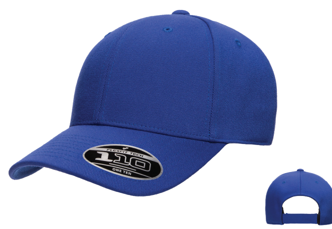
Moisture-wicking cap with performance sweatband. 6-panel structured cap with matching undervisor. Matching Hook & Loop closure with 8 rows of stitching on visor.