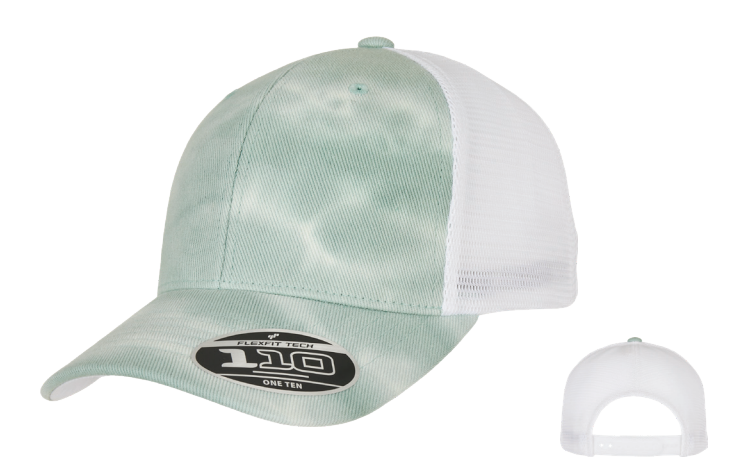
Hook & Loop

This Flexfit cap offers an elaborate look – its curved visor with decorative seams as well as the two front panels are made with a cool tie dye look, while the back consists of transparent mesh. The cap is size adjustable via its snapback closure on the back. Naturally, it is a one size fits all and is made of cotton and polyester mesh.