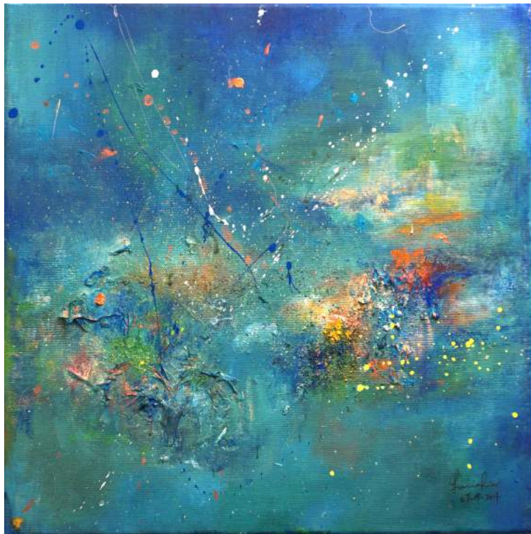
You go to my head 2017 Acrylic, paper towels on canvas