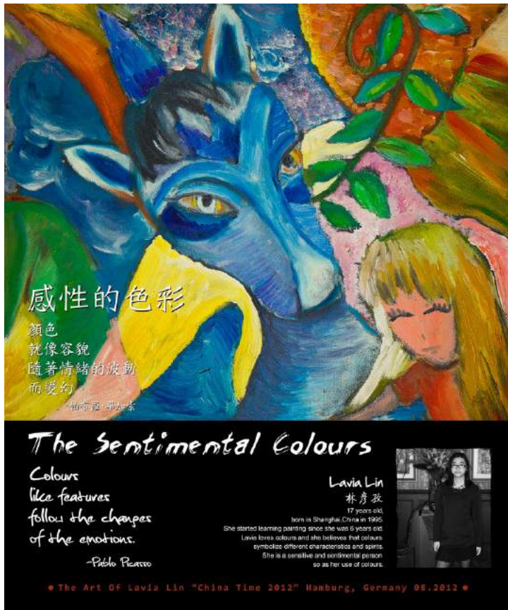
@ Lavia's first Solo Exhibition "The Sentimental Colours" in Hamburg