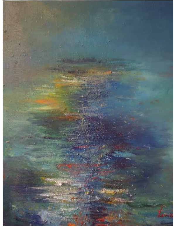
Blue in green 2016 Acrylic on Canvas