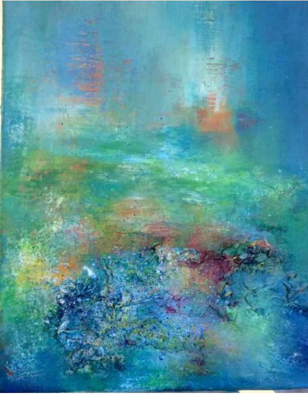
All the things you are 2016 Acrylic on Canvas