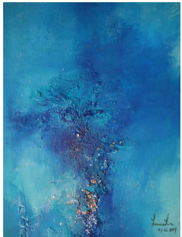
Born to be blue