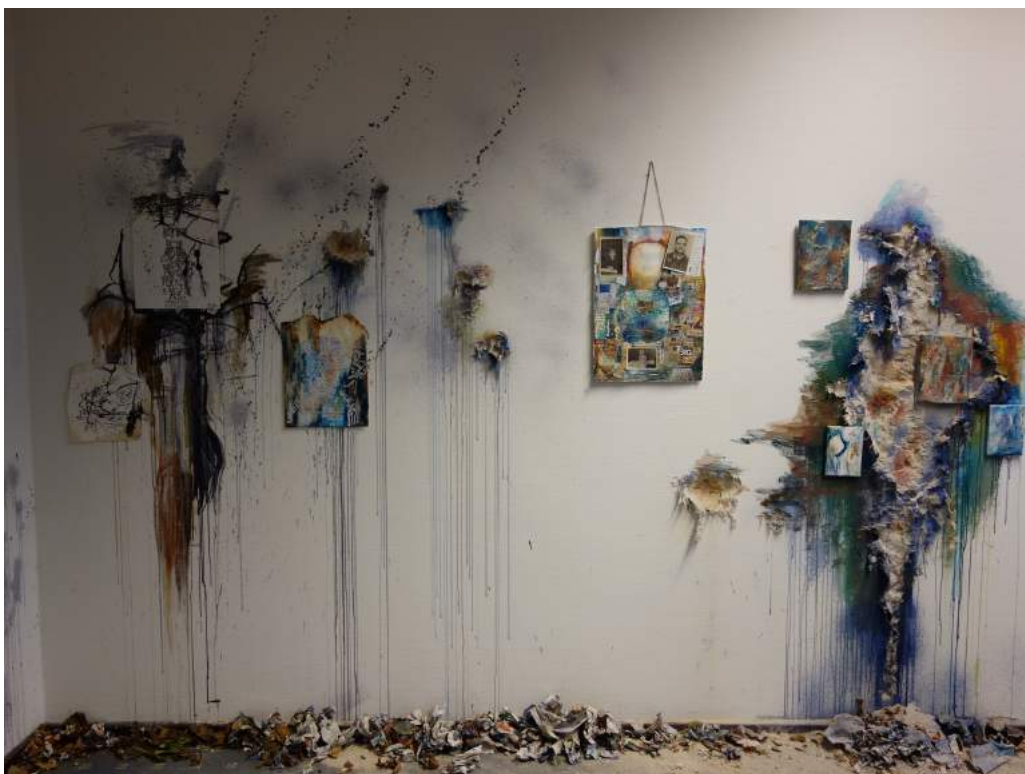
@Lavia's Raum at "Räume" Group exhibition