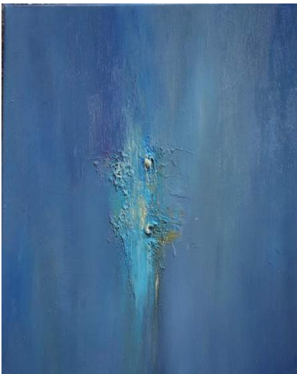
Blue because of you