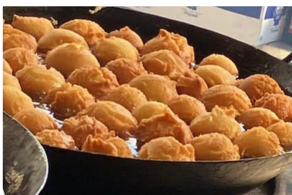
Delicious Andagi! Long lines.!

Thank you everyone who came, who helped and the main thing, did you enjoy yourself! Hope you did. See you next year! Please stay safe until then!