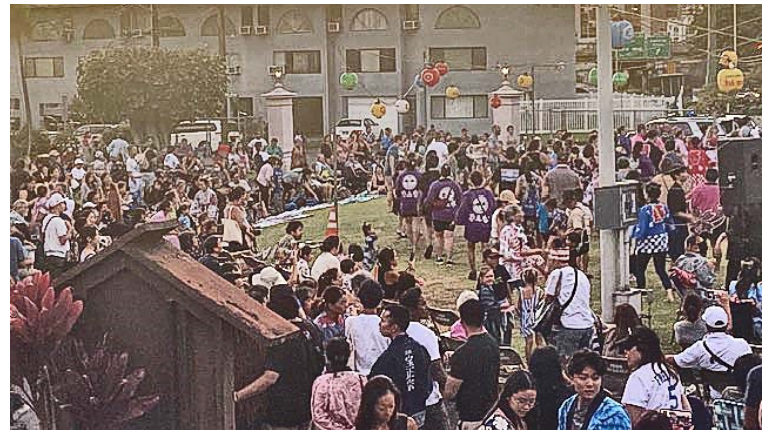
Dancers on the right dancing around the yagura and watchers on the left. So many people!