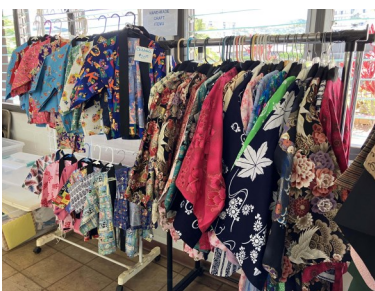
Lots of hap[I coats for sale!