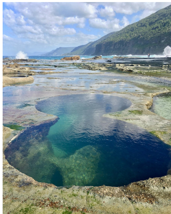
Figure Eight Pools, Royal National Park, NSW