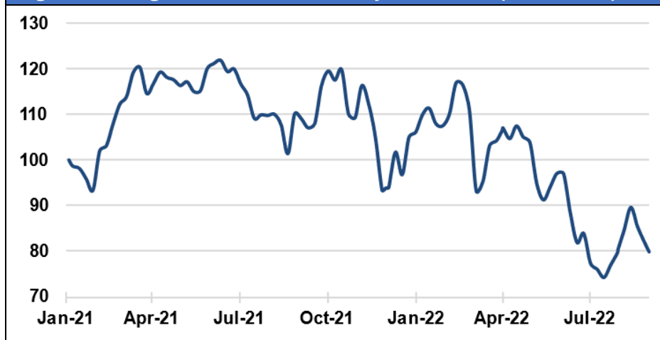
Figure 4: Pangolin Aviation Recovery Fund NAV (USD/share)