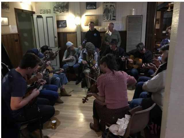
Live Music with Dinner