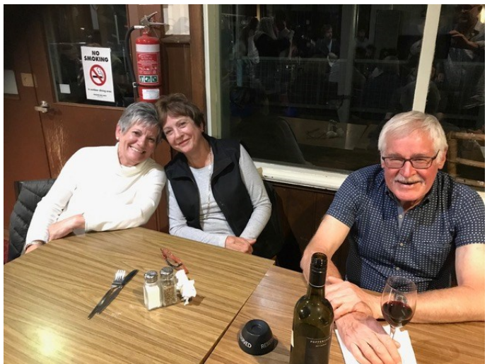
Dinner with Partners