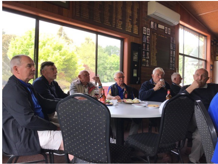
After Golf Drinks

From Club outing: Blackwood Special School Golf Day + Weekend away