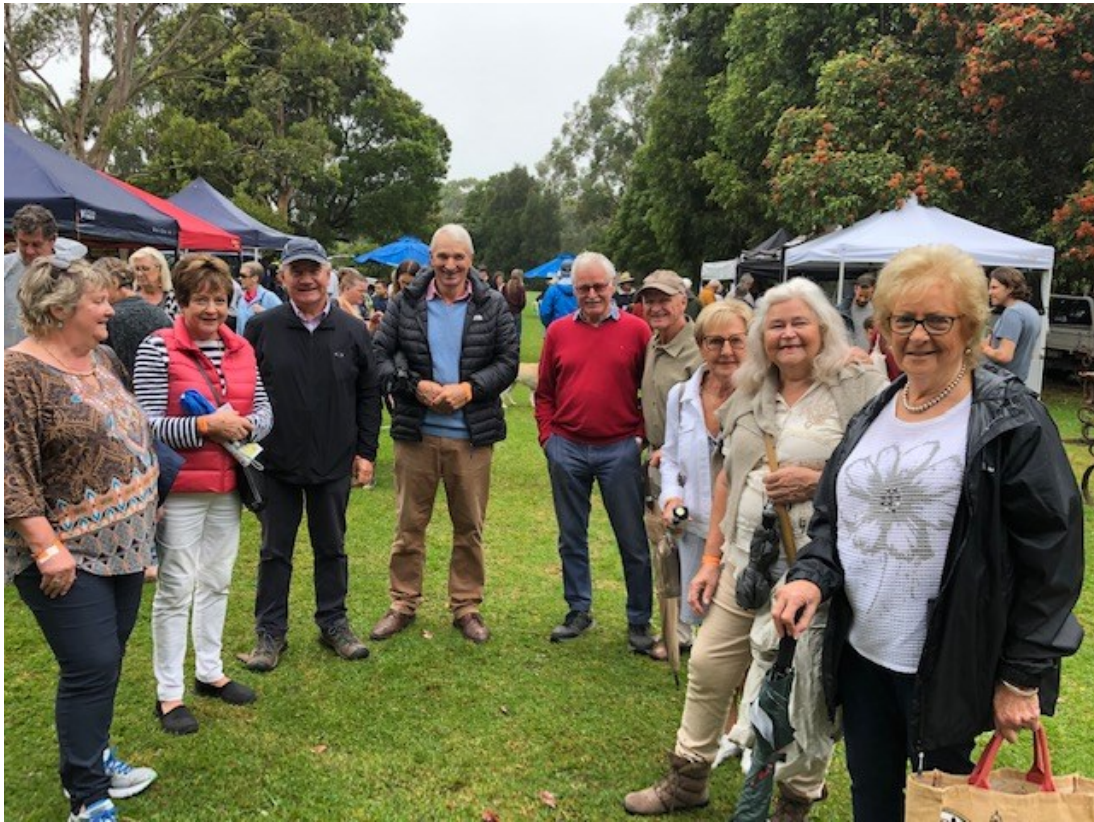
The band back together (Almost!)