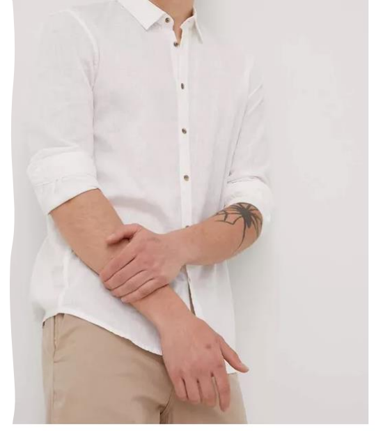
always like that