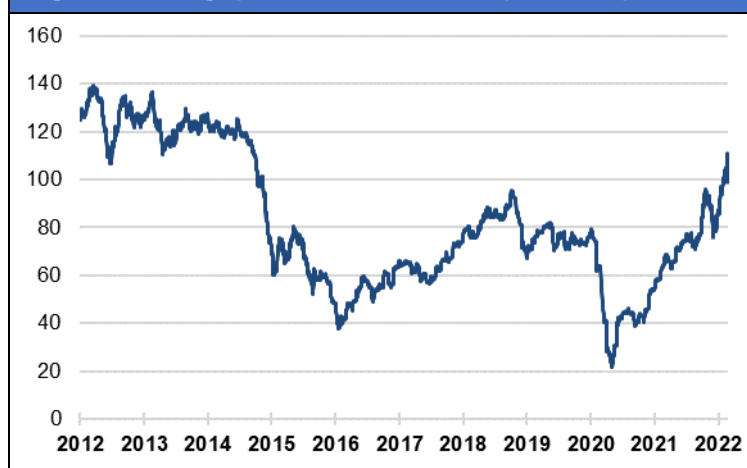
Figure 4: Singapore Jet Kerosene (USD/bbl)

The immediate effect of this war has been the spike of risk premiums attached to oil and gas products. Jet fuel prices have spiked to stratospheric levels last seen in 2014, adding further operating cost pressure for airlines. Long haul airlines are especially vulnerable, as they consume lots of fuel. Short-haul airlines are less affected, given their nature of operations and fuel is proportionally a smaller cost component compared to long-haul airlines. It is worth noting that all our airline investments are short-haul, low-cost carriers, which are comparatively least sensitive to any oil price surge.