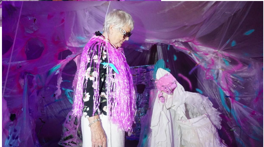
Reinconnection, 2018 – Mixed media installation – 25 x 12 meters Detail of a women wearing attributes and looking at sculptures

Detail of people laying between cotton wool, looking at video projections on a moving plastic ceiling. They are playing with attributes performers gave to them