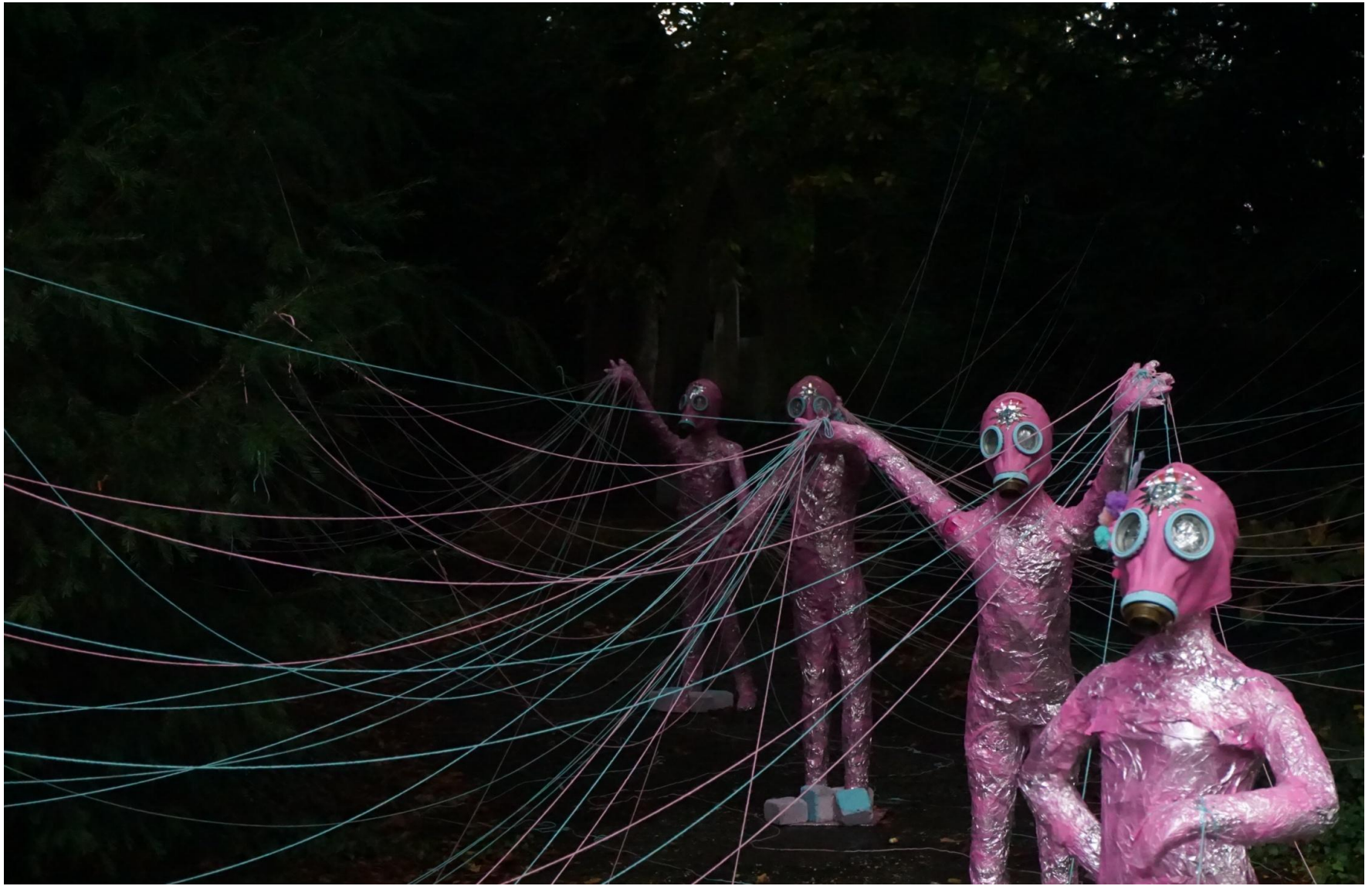
Canis lunatic, 2019 – Sculpture installation – at group exhibition Kloosterdagen Wittem NL

Wool, tinfoil, masks, stones, glitters, mannequins