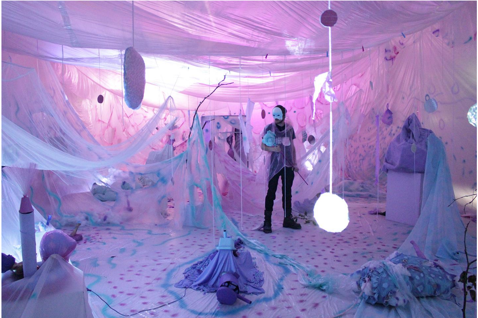
Reinconnection, 2018 – Mixed media installation – 25 x 12 meters – At Graduation show Maastricht Academy of Fine arts and Design NL Plastic, fabric, daily materials, paintings, wool, paper, glitters, sculptures, attributes., lights, ventilators Video projections, daily materials, paintings and strange sculptures become one world in a moving plastic cave where people can meet in the most surrealistic situations to discover their sensory powers and imagination.