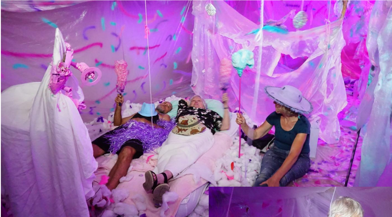
Reinconnection, 2018 – Mixed media installation – 25 x 12 meters

Detail of people laying between cotton wool, looking at video projections on a moving plastic ceiling. They are playing with attributes performers gave to them