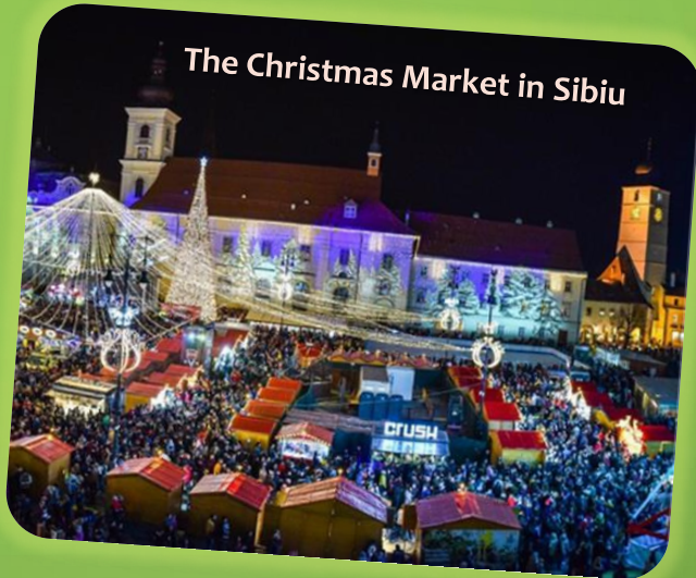
The Christmas Market in Sibiu