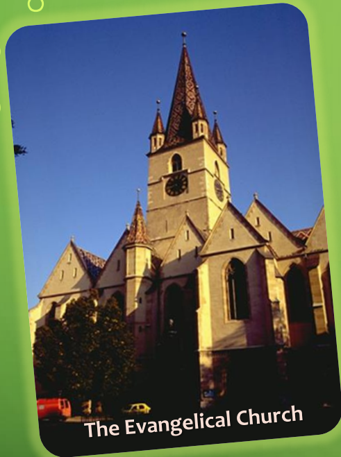
The Evangelical Church