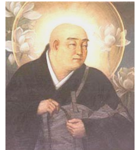
Founder of Jodo Shu : Honen Shonin (1133-1212)

Chutoba is available for this Gyoki service. At this service you may also honor your deceased ancestors with a Chutoba prayer. See above for the Chutoba order form.