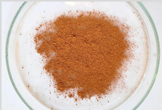
Photo of the schwertmannite synthesized in the lab of Hydrology at UBT.