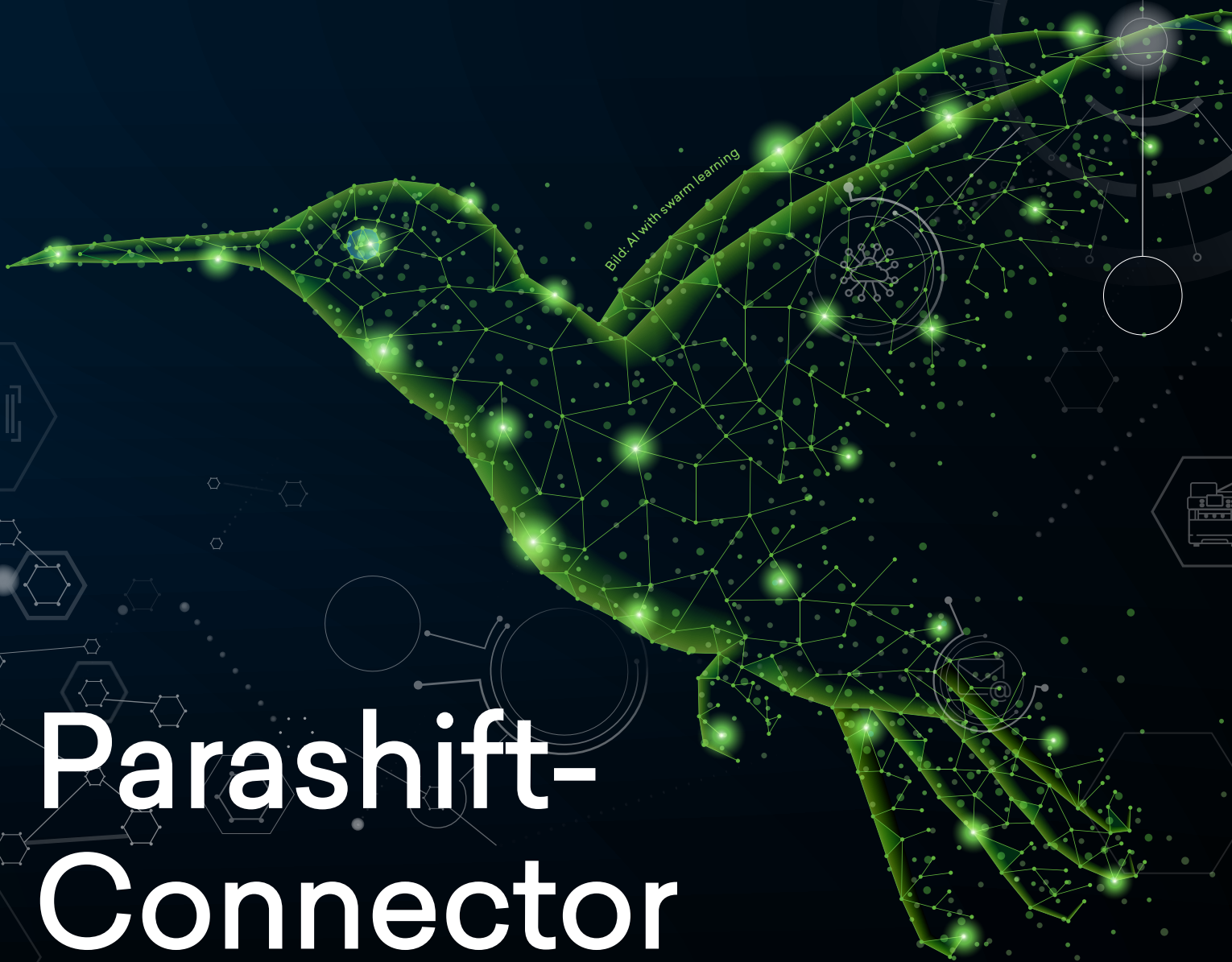
Bild: AI with swarm learning