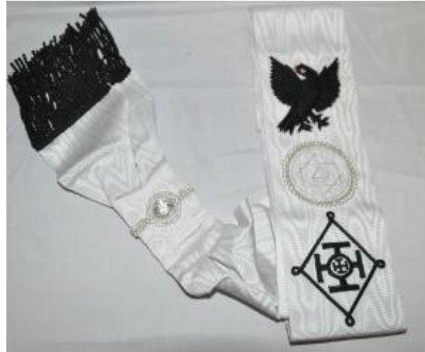
KHS Companion's Sash