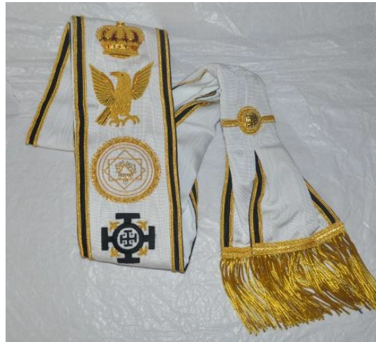
Red Cross of Constantine - Grand Officer's Sash