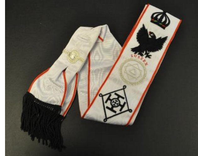
Red Cross of Constantine Divisional Sash