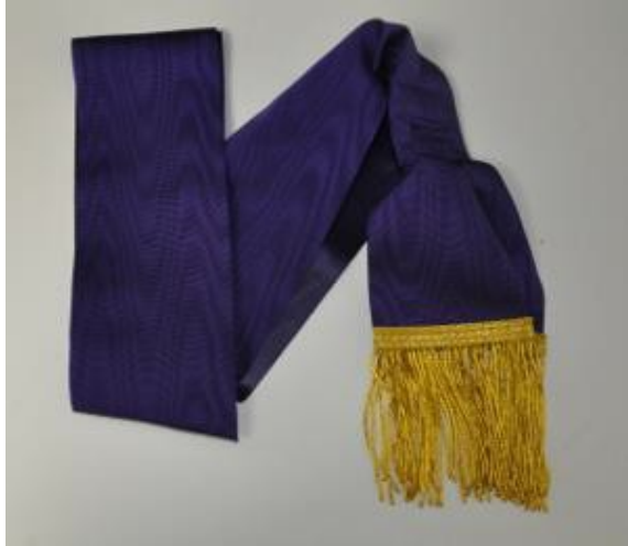
Red Cross of Constantine Companion's Sash