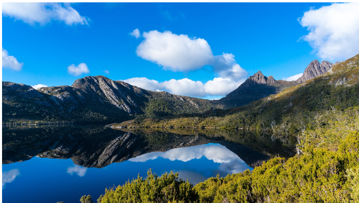
Cradle Mountain, Tasmania