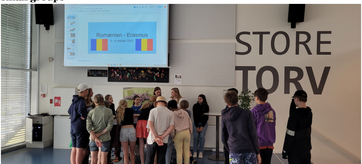
Erasmus-students presenting about the trip to Romania to one of the groups of pupils