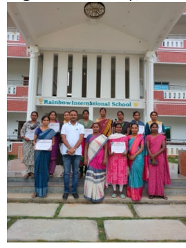
having the same passion.