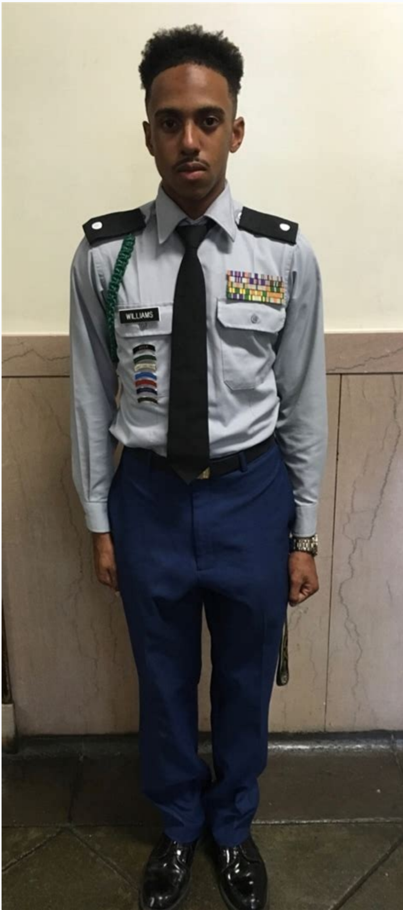
Army asu class b setup measurements. Army asu class b setup.

YUMPU automatically turns print PDFs into web optimized ePapers that Google loves. or Copy Army Class B Uniform (PDF) Extended embed settings IMMEDIATE RELEASE WASHINGTON - The U.S. Army released ALARACT 029/2021 today, providing an update allowing the optional wear of insignia and accoutrements on the Class B Army Green Service Uniform and Tropical Dress Variations. ALARACT 029/2021 authorizes the wear of insignia and accoutrements on the Class B uniform and prescribes wear of the AGSU Tropical Dress variation - additions to the current guidance. The ALARACT also includes an informational slide presentation for Soldiers and leaders. "Army senior leadership agreed that Soldiers throughout the Army should have the option to wear insignia and accoutrements on the AGSU Class B," said Sgt. Maj. Brian Sanders, the Army G-1 uniform policy sergeant major. United States Army Soldier wearing AGSU Class B/Tropical Dress variation with insignia and accoutrements. VIEW ORIGINAL The Tropical Dress Variation is primarily intended for Soldiers in hot climates and serves as the alternative for the Class A uniform. Local commanders will determine when their Soldiers wear this uniform variant. "Soldiers should refer to ALARACT 029/2021 for specific guidance and utilize DA PAM 670-1 (26 JAN 2021) for specifics on authorized items and composition of the uniform," said Sanders. The Army routinely examines its policies to ensure they meet the needs of the force.