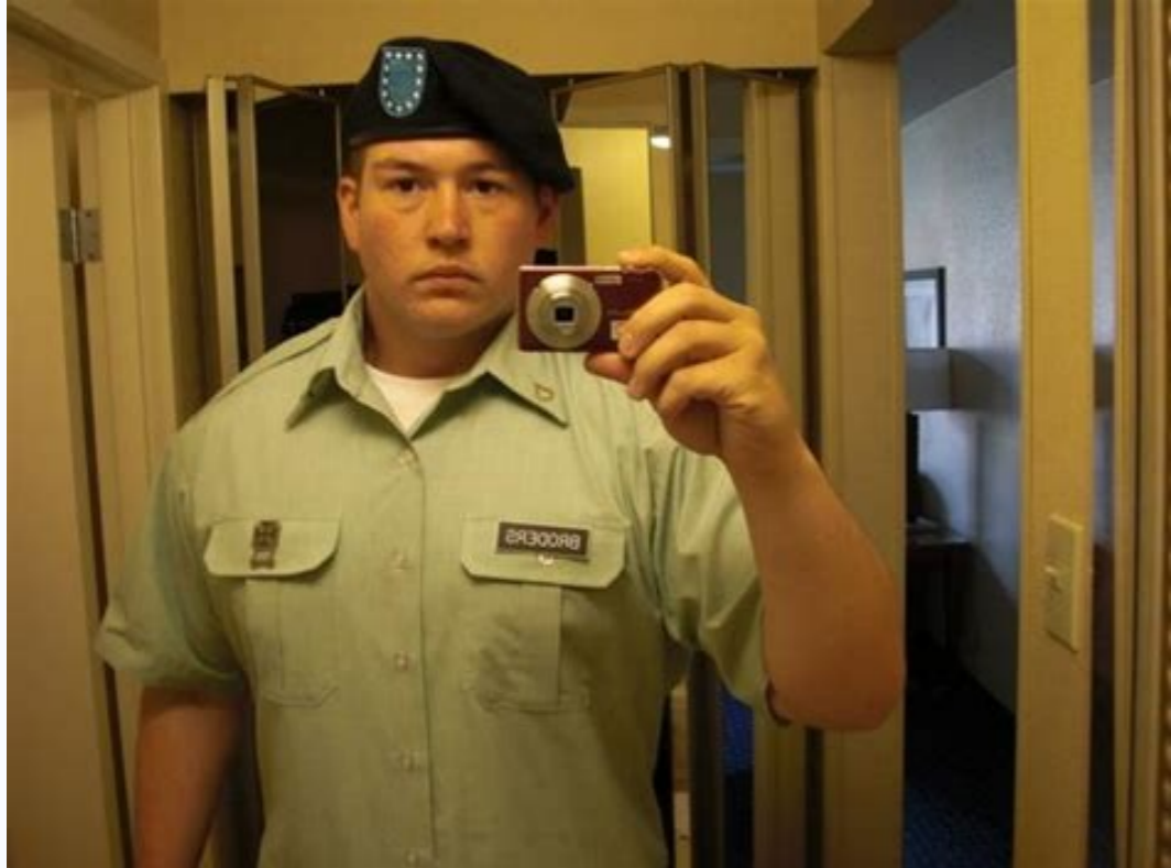
Army dress blues class b setup.