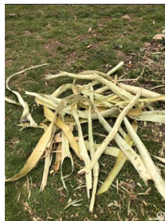
Paper plant after peeling