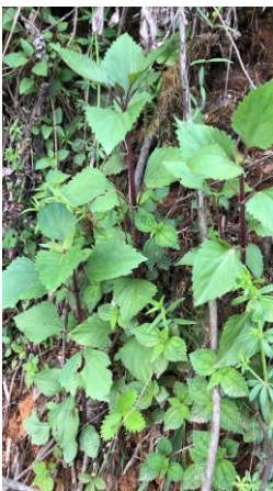
Banmara (medicinal herbs to control bleeding)