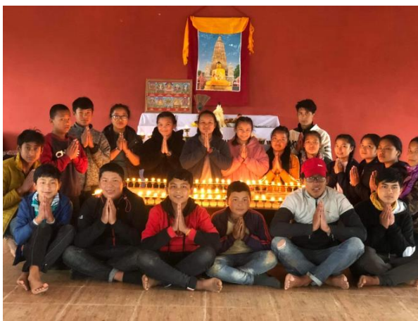
Buddha's Birthday with all the helpers