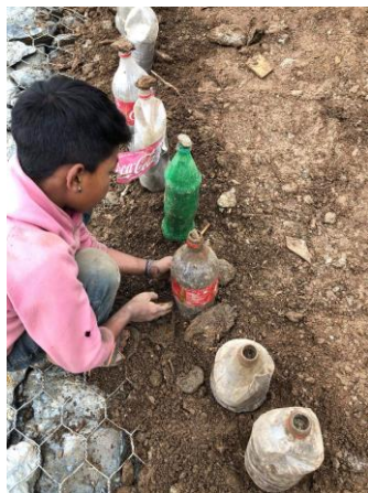
Pet bottles for the fence for the medicinal garden