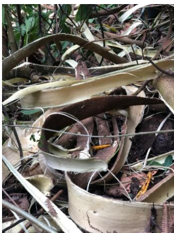
Paper plant before peeling

We are planting a plant for making paper and also collected paper. I help the family to plant the plant. Dealing with my day time.